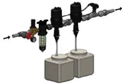
dual remote injection installation