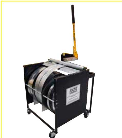
ITEM# 43008 FDCAB3 WITH SHEAR

For safety, the FDCS-12 has a safety pin to lock the shear in the open position and hold the 30" long handle upright and out of the way.