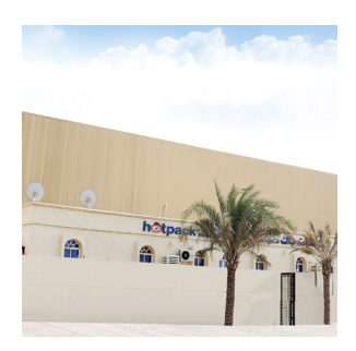
Film, Bag & Pouch Division Umm Al Quwain, UAE

Our state of the art manufacturing facilities across the region with the latest international technology extend to over two million square feet in area.