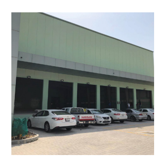
Folding Carton Division