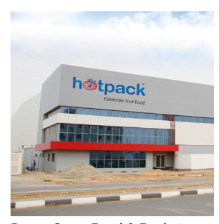
Paper Cups, Bowl & Bucket Umm Al Quwain, UAE