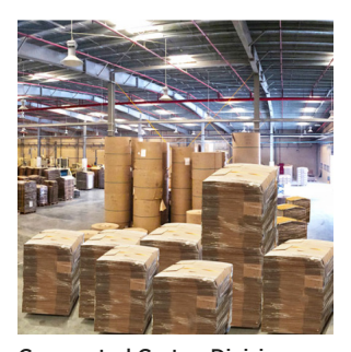
Corrugated Carton Division DIP-2, UAE