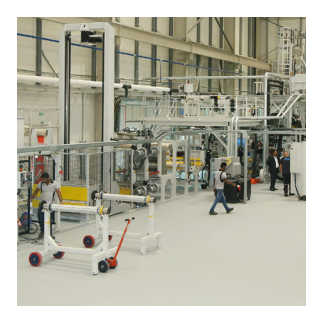
Film & Bag Division Riyad, KSA