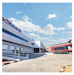
Rigid PET Packaging National Industries Park, UAE