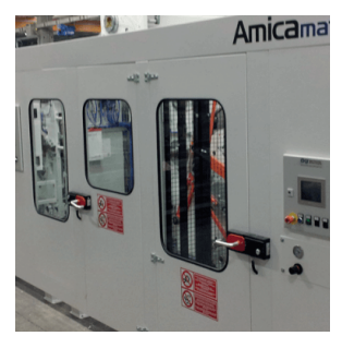
Tissue Paper Division Umm Al Quwain, UAE