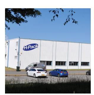
Paper Bag & Packaging Division Wrexham, UK