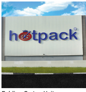
Folding Carton Unit Umm Al Quwain, UAE