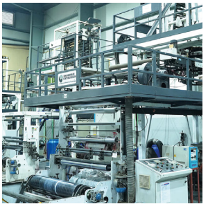
Recycled Plastics Division Sharjah, UAE