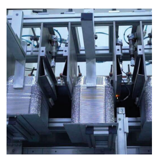
Aluminium Container Division