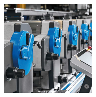
Self-Adhesive Label Division Umm Al Quwain, UAE