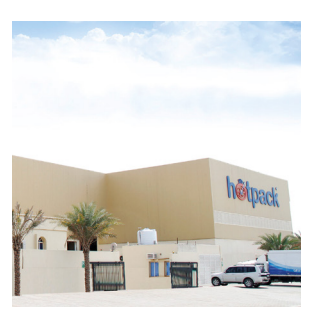
Flexible Packaging Division Umm Al Quwain, UAE