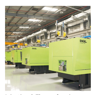
Injection & Thermoforming DIP-2, UAE