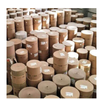
Paper Packaging Division Kerala, India