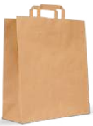
91PABABN2128FHG001 Paper Bag Brown Flat Handle 21x11x28 Cm