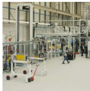
Film & Bag Division Riyad, KSA