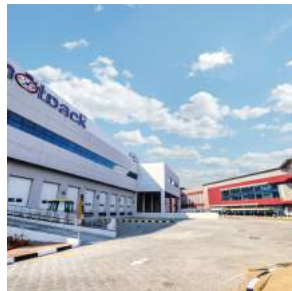
Rigid PET Packaging National Industries Park, UAE