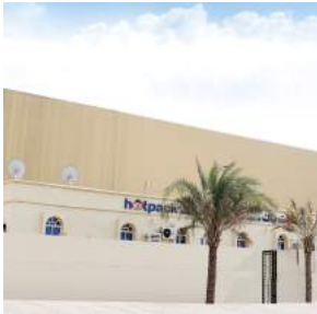
Film, Bag & Pouch Division Umm Al Quwain, UAE

Our state of the art manufacturing facilities across the region with the latest international technology extend to over two million square feet in area.