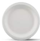
91ECPL0007INROG001 Biodegradable Round Plate 7 Inch