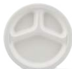
91ECPLCM09INROG001 Biodegradable 3 Compartment Round Plate 10 Inch