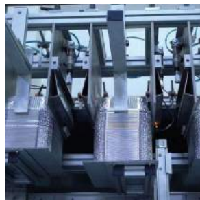
Aluminium Container Division Bahrain