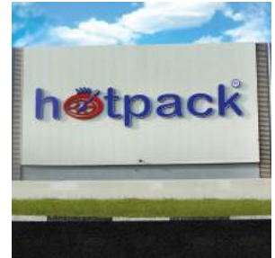
Folding Carton Unit Umm Al Quwain, UAE