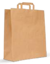
91PABABN3434FHG001 Paper Bag Brown Flat Handle 34x18x34 Cm