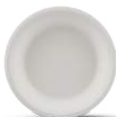
91ECPL0009INROG001 Biodegradable Hinged Plate 9 Inch