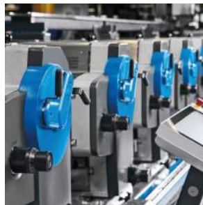
Self-Adhesive Label Division Umm Al Quwain, UAE