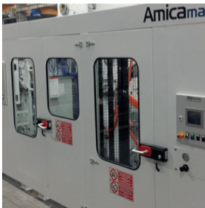
Tissue Paper Division Umm Al Quwain, UAE