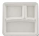
91ECPL0010INSQG001 Biodegradable 3 Compartment Square Tray 10 Inch