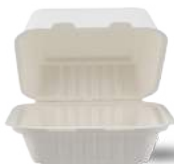
91ECBXBU06INBIG001 Biodegradable Burger Box Square 6 Inch