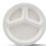
91ECPLCM09INROG001 Biodegradable 3 Compartment Round Plate 9 Inch