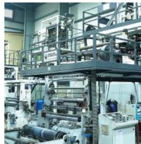
Recycled Plastics Division Sharjah, UAE