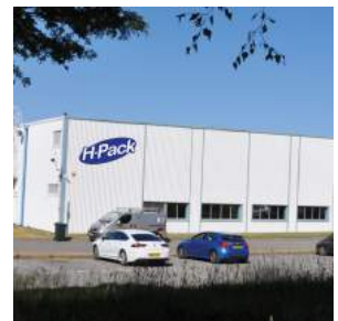
Paper Bag & Packaging Division Wrexham, UK