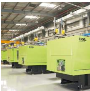
Injection & Thermoforming DIP-2, UAE