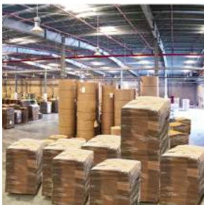
Corrugated Carton Division DIP-2, UAE