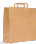
91PABABN2930FHG001 Paper Bag Brown Flat Handle 29x15x30 Cm