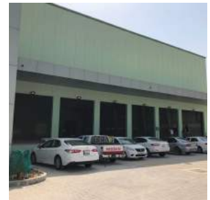
Folding Carton Division Qatar