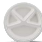
91ECTRCM12INROG001 Biodegradable 4 Compartment Round Plate 12 Inch