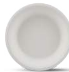
91ECPL0009INROG001 Biodegradable Hinged Plate 12 Inch