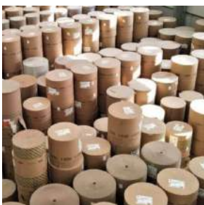
Paper Packaging Division Kerala, India