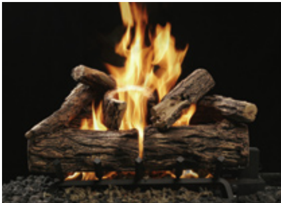
VGB24 / VLOG24 Grate Burner