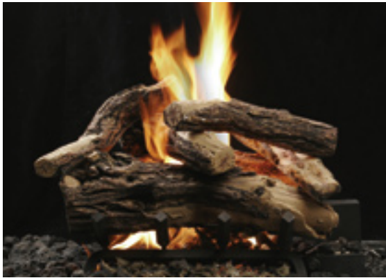
VGB18 / VLOG18 Grate Burner