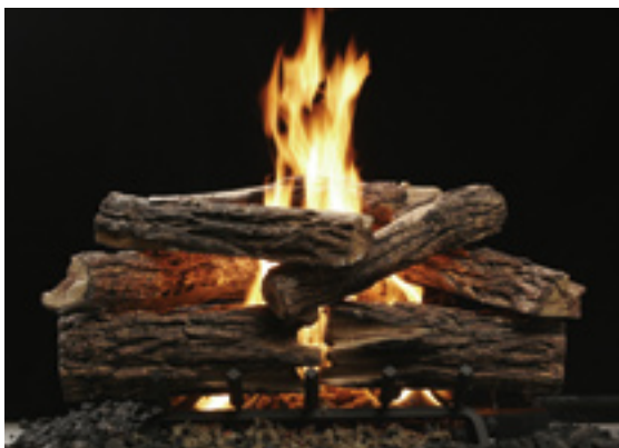
VGB24 / VLOG30 Grate Burner