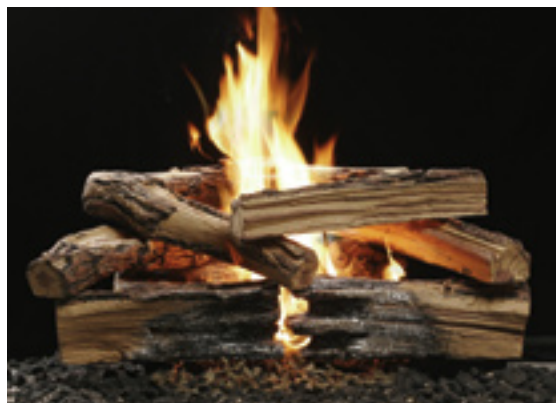
VSB24 / VLOG30 Ash Bed Burner