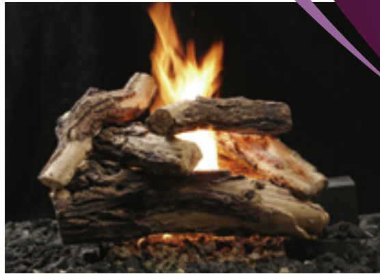
VSB18 / VLOG18 Ash Bed Burner