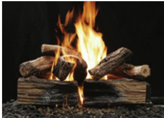
VSB24 / VLOG24 Ash Bed Burner