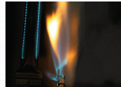
Instant JETFIRE™ Ignition