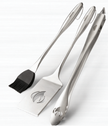
PRO STAINLESS STEEL 3 PIECE TOOLSET #70034