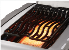
Infrared SIZZLE ZONE™ Side Burner