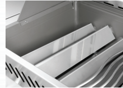
Dual-Level Stainless Steel Sear Plates