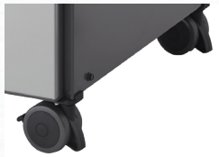
EASY ROLL Locking Casters