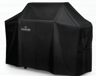
PREMIUM FITTED COVER #61500