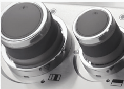
Ergonomic Control Knobs Soft Touch Grip