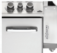
Folding Side Shelf