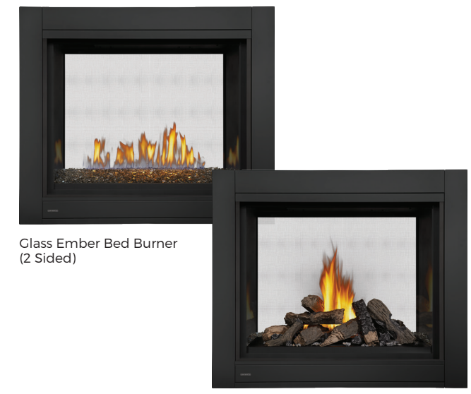
PHAZER™ Log Set Burner (2 Sided)