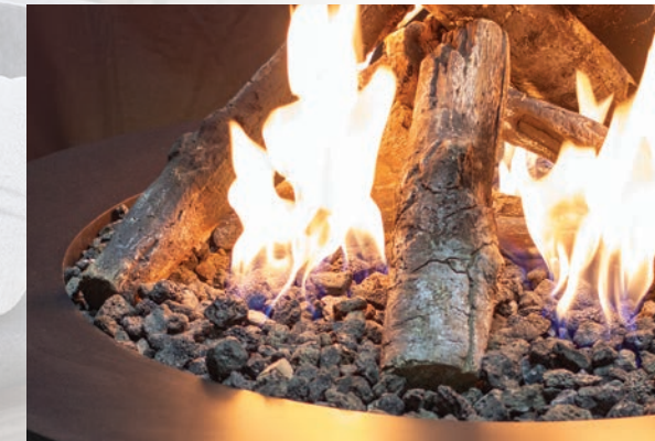
Logs over Lava Rock