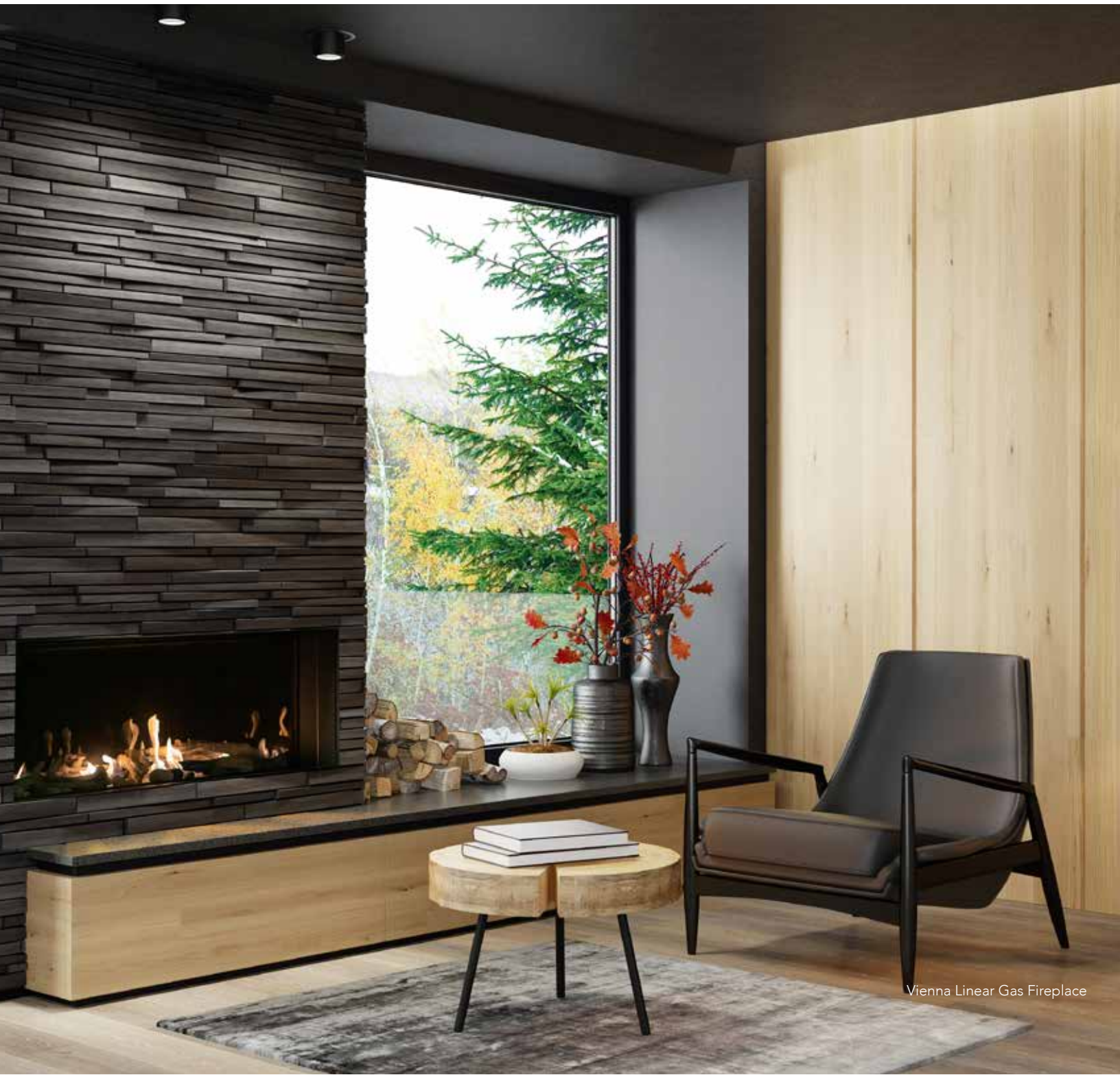
Vienna Linear Gas Fireplace