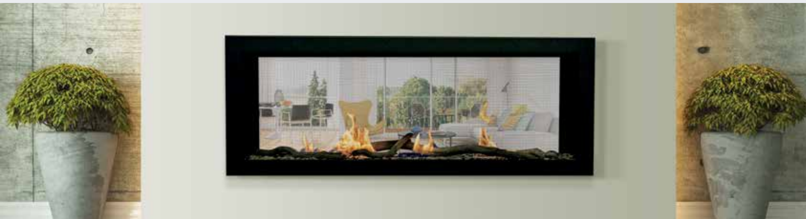
THE EMERSON 48ST

*For surrounds add between 5-20 lbs depending on the size of the unit.