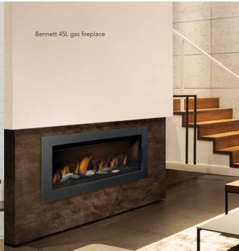
Bennett 45L gas fireplace