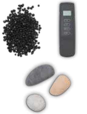
THE NEWCOMB 36DV