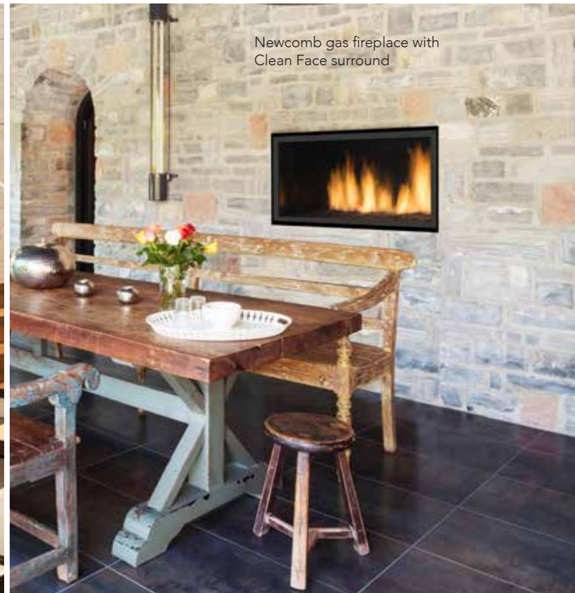
Newcomb gas fireplace with Clean Face surround