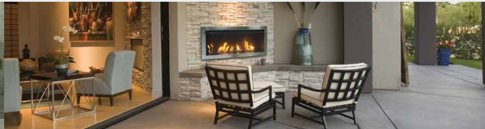
THE TAHOE 45OL

*For surrounds add between 5-20 lbs depending on the size of the unit.