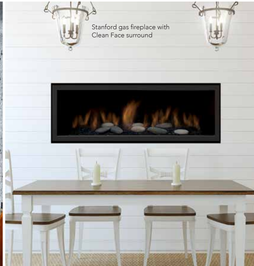
Stanford gas fireplace with Clean Face surround