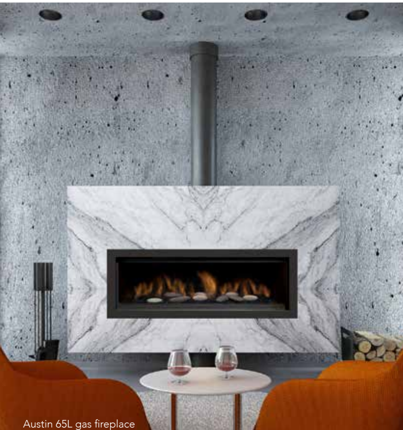
Austin 65L gas fireplace