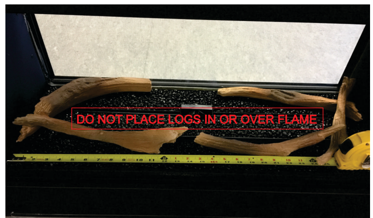
Palisade & Newcomb