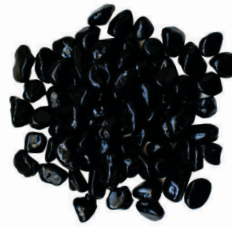
Black fire glass

DO NOT PLACE LOGS DIRECTLY ON OR OVER FLAMES. Logs must be placed to avoid the flame completely. See examples below.