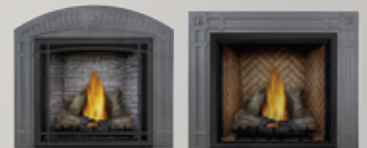
ARCHED AND RECTANGULAR WROUGHT IRON SURROUNDS