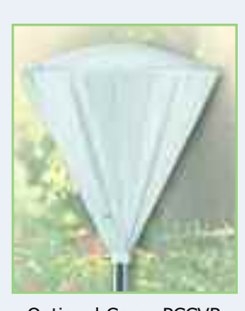
Optional Cover PCCVR