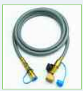
Natural gas hook-up/ installation kit included