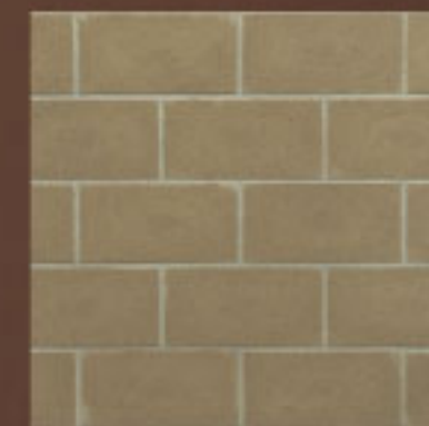
Full Running Bond