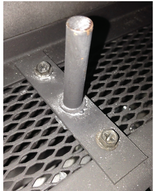
Figure 1 – Log Pin Assembly

NOTE: Prior to installing the log set, you must first install the pin brackets on the burner. The air deflection glass and fireglass should only be installed after the pin brackets are in place. The air deflection glass should be installed prior to placing and fireglass on the burner. The logs must then be placed in the unit after the fireglass and air deflection glass. If the optional logs are added after the air deflection glass and fireglass are in use, move the fireglass away from the areas in Figure 1 and install the support brackets, then arrange fireglass evenly across burner again.