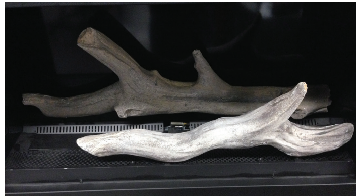
Figure 4 – Alternative Front Log Placement

Hearth & Home Technologies 7571 215th Street West, Lakeville, MN 55044 www.hearthnhome.com