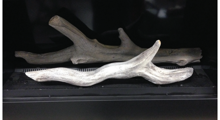
Figure 3– Front Log Placement