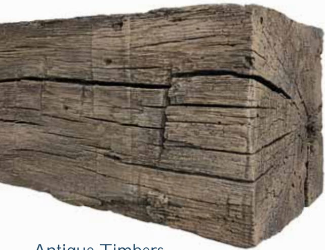
Antique Timbers, Without the Splinters

THE BEAUTY OF NATURAL MATERIALS IN NON-COMBUSTIBLE MANTELS