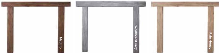
HITCHING POST | ROUGH SAWN AVAILABLE IN ONE SIZE CEDAR POST SUPPORT HEIGHT IS CUSTOMIZABLE