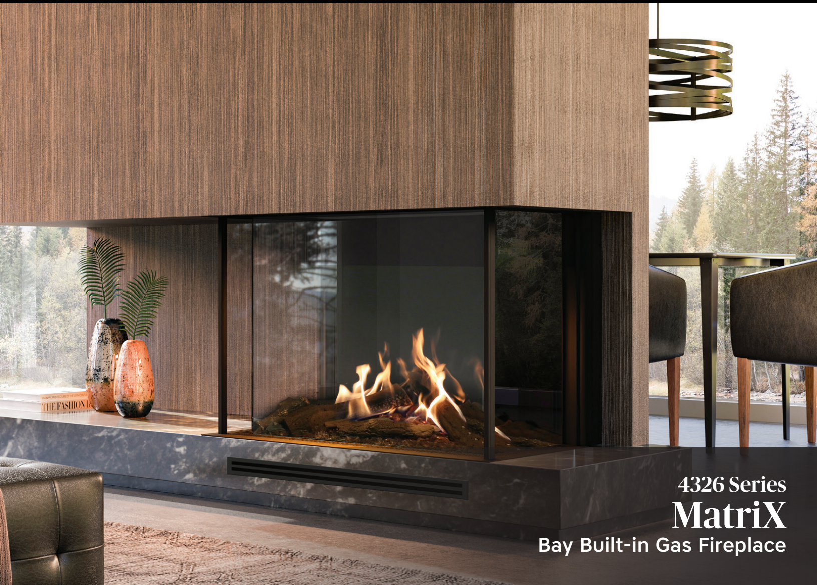
4326 Series Matrix Bay Built-in Gas Fireplace

Faber helps you create the atmosphere and look you desire for your unique space. Our built-in Matrix models let you design your fireplace - to viewing angles and finishes.