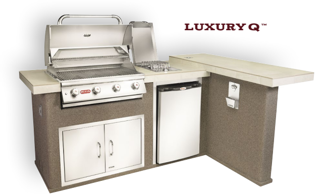
Shown with: Sterlina Ivory Tile & Stucco Rock 304 Base