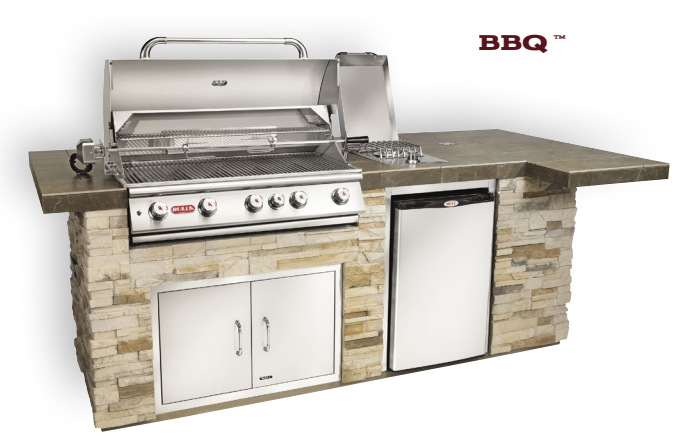
Shown with: Sterlina Henna Tile & Montreal Rock Base