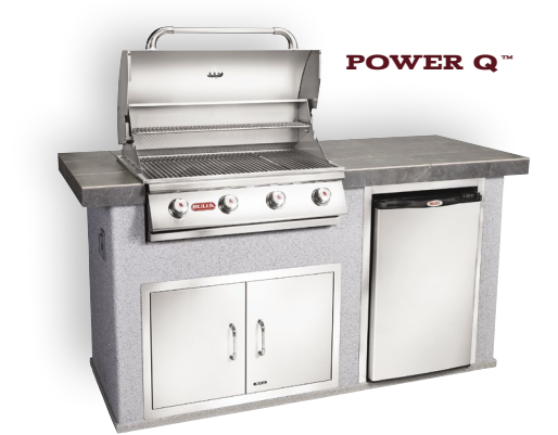
Shown with: Sterlina Asphalt Tile & Stucco Rock 16 Base

Our design experts have solutions to fit any situation and will match your needs with over 40 tile and base combinations, 18 standard features, and over 90 optional upgrades.