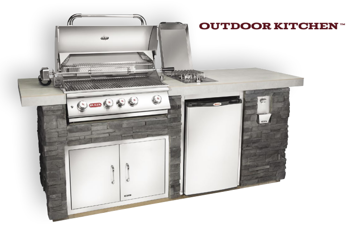
Shown with: Sterlina Grey Tile & Grey Stone Rock Base

Our design experts have solutions to fit any situation and will match your needs with over 40 tile and base combinations, 18 standard features, and over 90 optional upgrades.