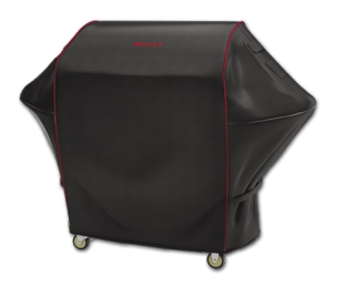
CART COVER All Cart and Grill Head covers available online