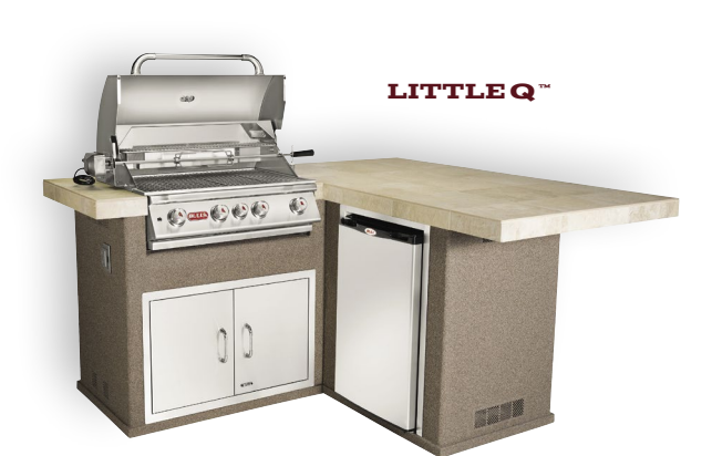
Shown with: Brava Ivory Tile & Stucco Rock 304 Base