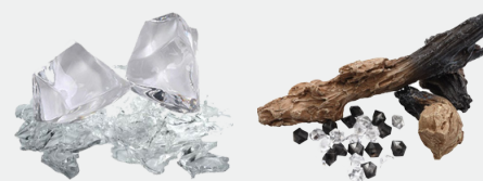
Crystal and Log sets included