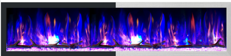
Black trim included, optional silver trim for purchase