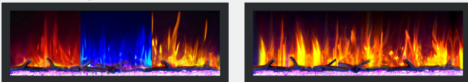
Controllable Red, Blue, and Yellow intensities, with color mixing capability