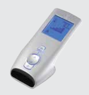
ProFlame Remote (Included with Variable Control Model)