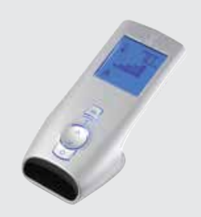
ProFlame Remote (Included with Variable Control Model)