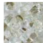
Platinum Crushed Glass