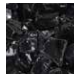
Refl. Black Crushed Glass (Standard)