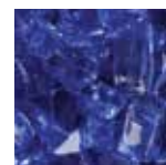
Refl. Blue Crushed Glass