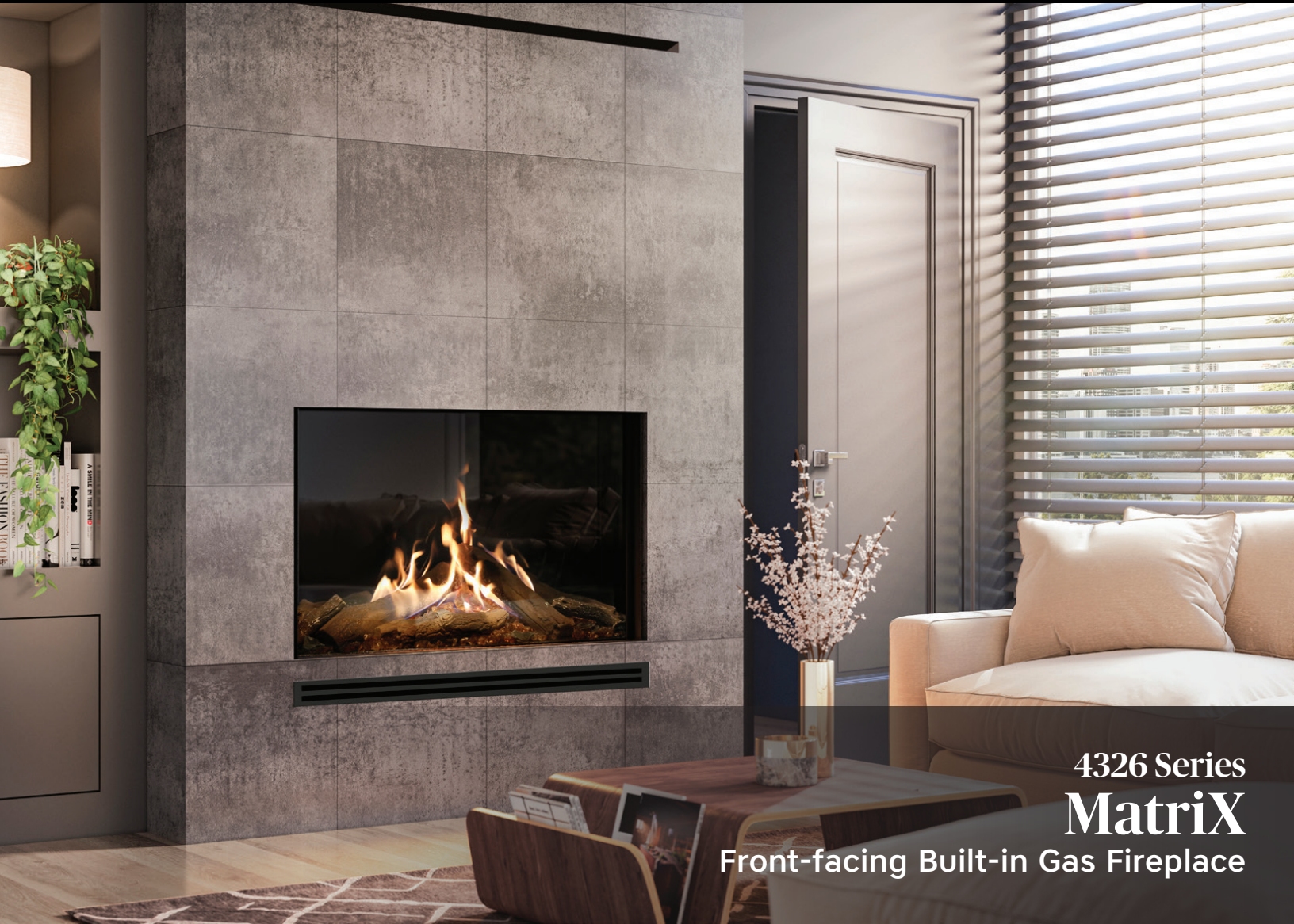
4326 Series Matrix Front-facing Built-in Gas Fireplace

Faber helps you create the atmosphere and look you desire for your unique space. Our built-in Matrix models let you design your fireplace - to viewing angles and finishes.