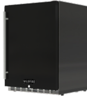
24" FRIDGE BLACK SLEEVE • Fits # WFR-24-BSS # WFR-24SLV-BSS