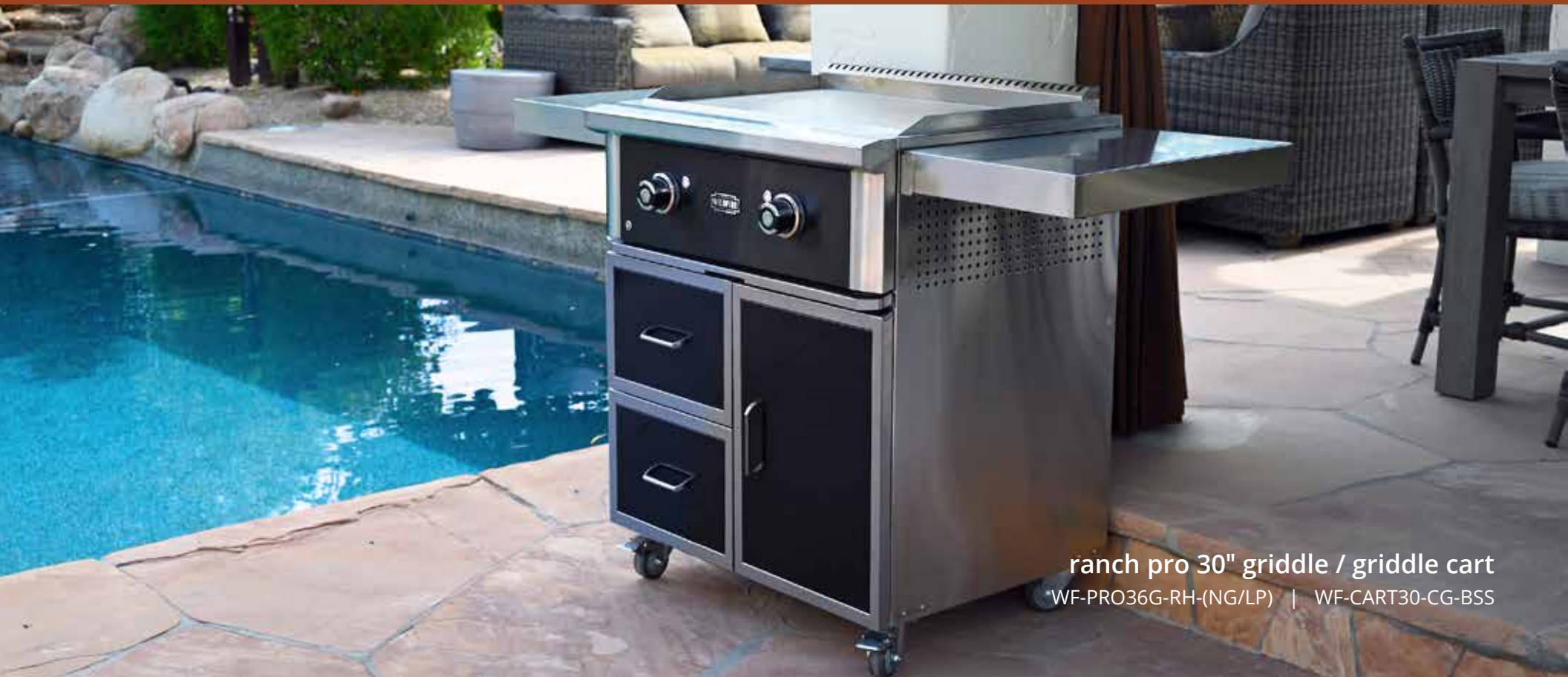
ranch pro 30" griddle / griddle cart WF-PRO36G-RH-(NG/LP) | WF-CART30-CG-BSS

Effortlessly smooth cooking from breakfast to dinner. Stainless steel surface griddle is perfect for cooking griddle type foods.