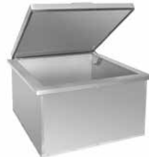
ICE CHEST (LARGE) • 304 Stainless Steel Finish • Built-in Design • 24 3/8" x 25 3/8" x 17" # WF-LIC