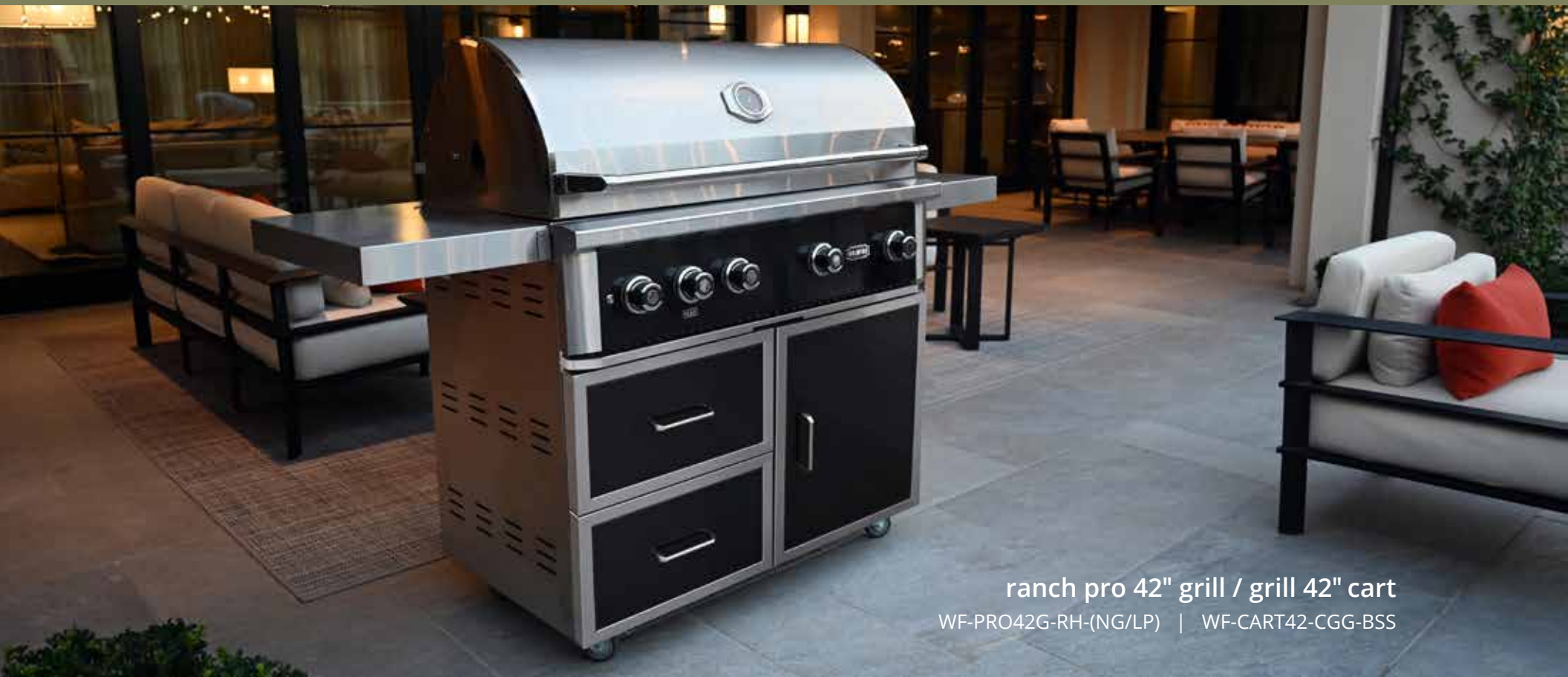
ranch pro 42" grill / grill 42" cart WF-PRO42G-RH-(NG/LP) | WF-CART42-CGG-BSS

Looking for the perfect spot to grill? Our grill and griddle carts make it easy for you to set up anywhere. Mobile? Yes. But our carts pack the same top-quality construction, function and looks as our island grills.