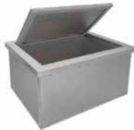
ICE CHEST (SMALL) • 304 Stainless Steel Finish • Built-in Design • 25" x 18" X 15" # WF-SIC