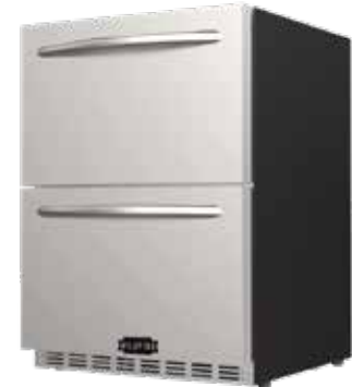
24" DUAL DRAWER FRIDGE • 304 Black Stainless Steel Finish • Built-in / Slide-in Design • 5.3 CU. FT. # WFRDD-24