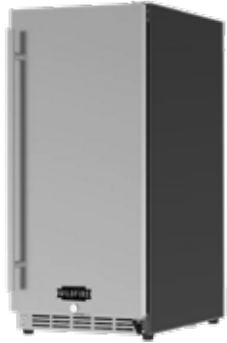
15" OUTDOOR FRIDGE • 304 Black Stainless Steel Finish • Built-in / Slide-in Design • 3.2 CU.FT. # WFR-15