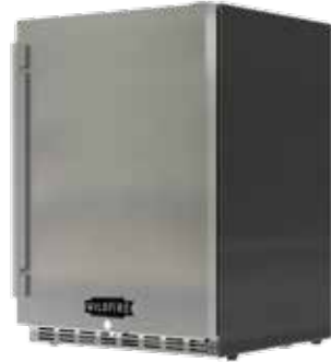
24" OUTDOOR FRIDGE • 304 Black Stainless Steel Finish • Built-in Design • 5.3 CU.FT. # WFR-24