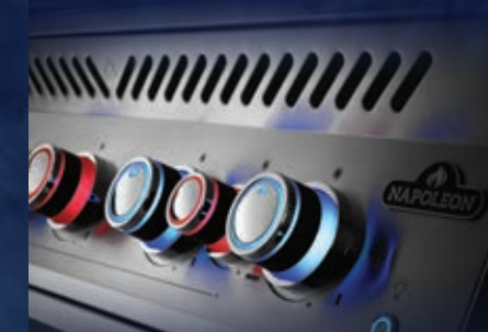
NIGHT LIGHT™ Control Knobs with SafetyGlow

The control knobs with SafetyGlow turn red when a burner is in use