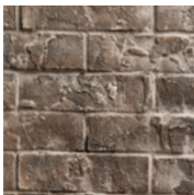
Traditional Brick Liner RLT