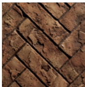
Herringbone Brick Liner RLH

Model ZVF24 Vent-Free Firebox with ZVFB2426MVN Vent-Free Burner System (Natural Gas) LOGF10 Log Set, ZVF24RLT Brick Liner (Traditional), ZVF24SDBL Surround Deluxe (Black).