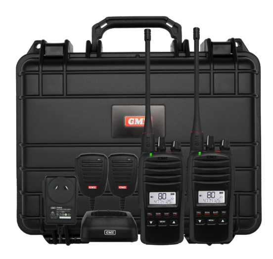
5 Year Warranty

Rotary Channel Selection with Voice Announcement