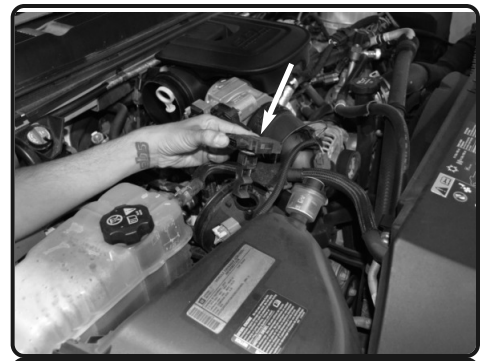
Remove the factory torx screws from the MAF sensor and then remove the MAF sensor from the factoryu air box assembly.