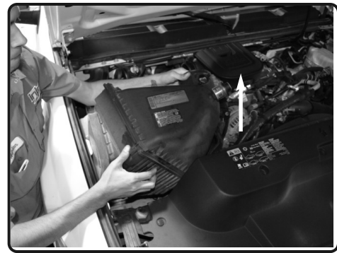
4. Firmly lift up on the stock air box assembly and pull the stock air box assembly out of the engine bay.