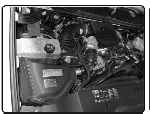
1. Stock intake system shown.