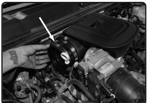
12. Place the 4.25"-4.50" step hose and two #72 clamps onto the turbo inlet. Tighten the clamp on the turbo inlet side for now.