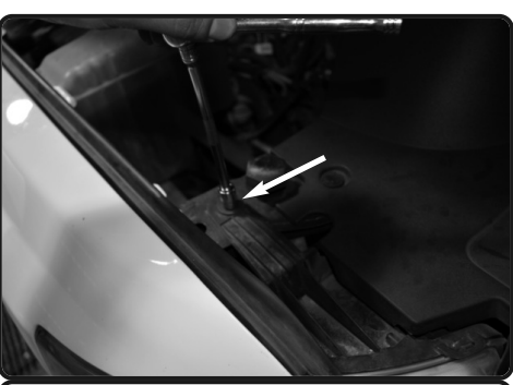
9. Remove the 10mm headlight bracket bolt on the passenger side head light. The Injen air box assembly will bolt up to this bolt.