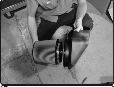
7. Place the filter onto the the Injen intake plenum and then secure the clamp.