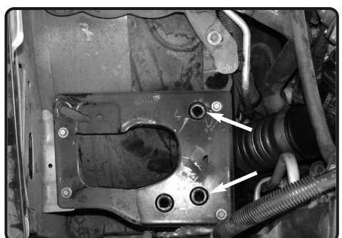
10. The factory air box assembly bracket is shown in the photo. Arrows indicate the grommets where the Injen air box mounts will go.