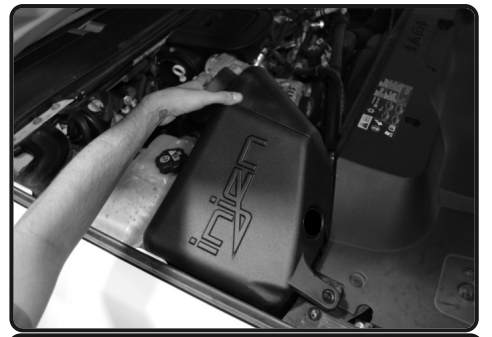
11. Lower the Injen air box into the engine bay. Make sure the pegs under the Injen air box goes into the factory air box grommets on the air box tray from figure 10