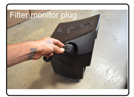
5. Place the Filter Minder plug into the hole in the Injen air box