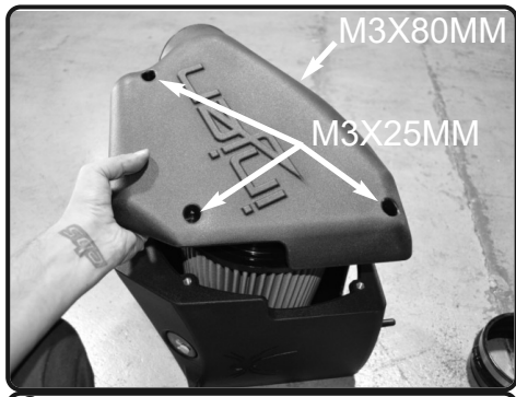
8. Place the three M6X25mm bolts and one M6X80mm into the plenum illustrated by the photo. Your Injen air box assembly is now complete.