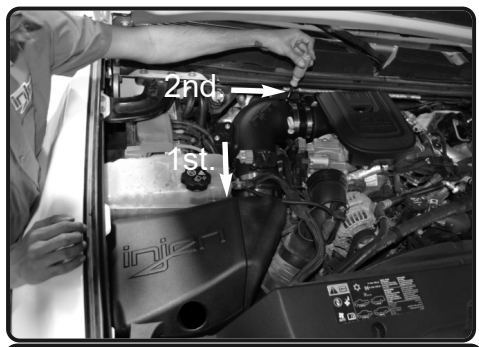
14. First slide the big end of the intake pipe into the 5.0" hump hose on the air box plenum. Then slip the smaller end into the 4.25"-4.50" step hose on the turbo inlet. Once intake is adjusted, tighten all clamps.