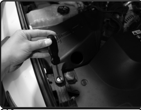
16. Reuse the factory 8mm bolt and secure the Injen air box bracket to the passenger side headlight bracket.