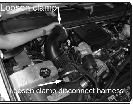
Disconnect the MAF sensor harness.Loosen the clamp on the intake duct and then remove entire air duct