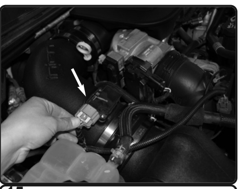
15. Place the MAF sensor onto the intake tube and then secure it with the supplied M4 bolts. Reconnect the MAF sensor harnesse