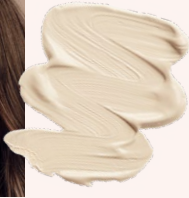
Cream (NL2) Light with neutral undertones