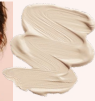
Nude (NL3) Medium with neutral undertones