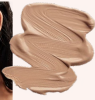
Tan (PL8) Tan with cool undertones