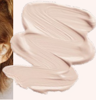
Porcelain (PL1) Light with cool undertones