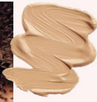
Honey (YL7) Medium to tan with warm undertones