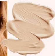
Beige (YL6) Medium to tan with warm undertones