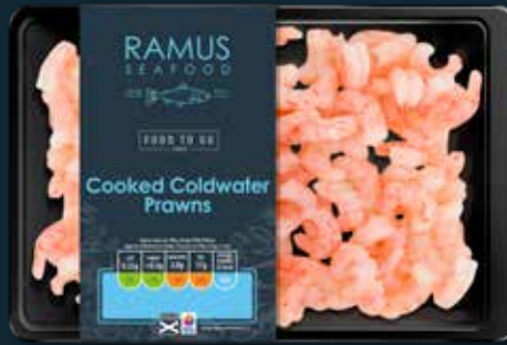
RAMUS FOOD TO GO Cooked Cold Water Prawns 150g