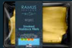
RAMUS NATURAL Smoked Haddock Fillets 200g