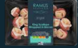
RAMUS KITCHEN King Scallops Wrapped in Bacon 180g