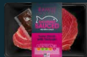
RAMUS SUSTAINABLY SAUCED Tuna Steak with Teriyaki 200g