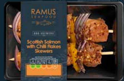
RAMUS - BBQ SKEWERS Scottish Salmon with Chilli Flakes Skewers 150g