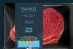
RAMUS NATURAL Tuna Steak 200g