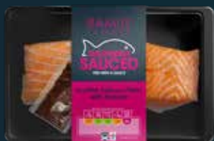
RAMUS SUSTAINABLY SAUCED Scottish Salmon Fillets with Teriyaki 240g

'Sustainably Sauced' pairs our very best cuts of sustainable fish and seafood with our chef's delicious homemade sauces. They are beautifully presented and offer excellent shelf life