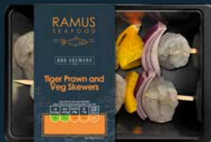
RAMUS - BBQ SKEWERS Tiger Prawn and Veg Skewers 90g