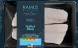
RAMUS NATURAL Halibut Fillets 200g