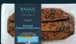
RAMUS NATURAL Smoked Peppered Mackerel 180g