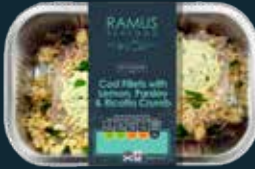
RAMUS KITCHEN Cod Fillets with Lemon, Parsley & Ricotta Crumb 200g