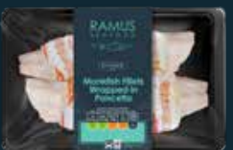
RAMUS KITCHEN Monkfish Fillets Wrapped in Pancetta 200g