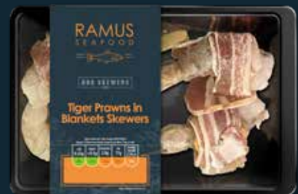
RAMUS - BBQ SKEWERS Tiger Prawns in Blankets Skewers 180g