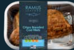
RAMUS NATURAL Crispy Breaded Cod Fillets 240g