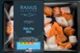
RAMUS NATURAL Fish Pie Mix 250g