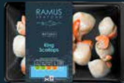
RAMUS NATURAL King Scallops 150g