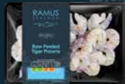
RAMUS NATURAL Raw Peeled Tiger Prawns 200g