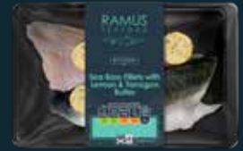
RAMUS KITCHEN Sea Bass Fillets with Lemon & Tarragon Butter 180g