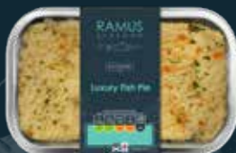
RAMUS KITCHEN Luxury Fish Pie 600g