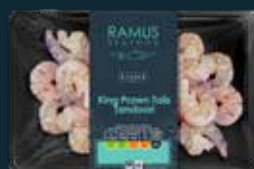
RAMUS KITCHEN King Prawn Tails Tandoori 180g