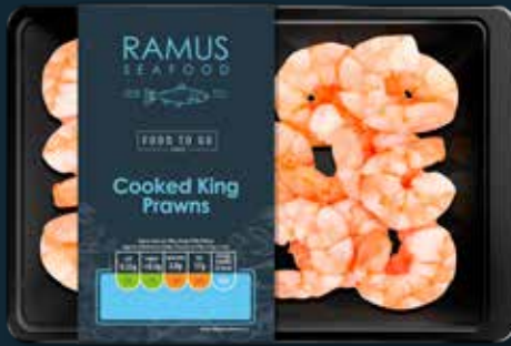
RAMUS FOOD TO GO Cooked King Prawns 150g

Our Food To Go range is made up of the finest fish and seafood, perfectly prepared and ready to eat. The contemporary packaging is eye-catching, shelf ready, precision sealed, informative and offers excellent shelf life