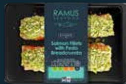
RAMUS KITCHEN Salmon Fillets with Pesto Breadcrumbs 240g