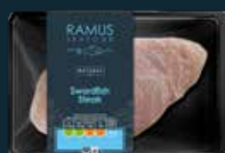
RAMUS NATURAL Swordfish Steak 200g