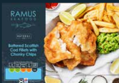
RAMUS NATURAL - FROZEN Battered Scottish Cod Fillets with Chunky Chips 280g