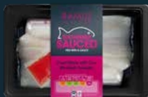
RAMUS SUSTAINABLY SAUCED Cod Fillets with Sun Blushed Tomato 200g