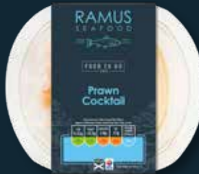
RAMUS FOOD TO GO Prawn Cocktail 170g