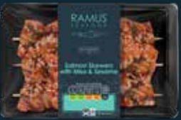
RAMUS KITCHEN Salmon Skewers with Miso & Sesame 240g