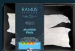
RAMUS NATURAL Monkfish Fillets 200g