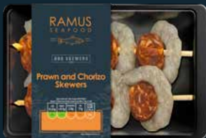
RAMUS - BBQ SKEWERS Tiger Prawn and Chorizo Skewers 90g