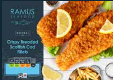
RAMUS NATURAL - FROZEN Crispy Breaded Scottish Cod Fillets 440g

The Natural range incorporates our finest frozen fish and seafood without compromising on quality. With vibrant packaging and long life, these outstanding products provide a perfect and complementary range addition