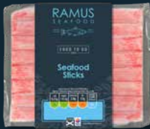
RAMUS FOOD TO GO Seafood Sticks 100g