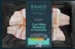
RAMUS KITCHEN Cod Fillets Wrapped in Pancetta 200g