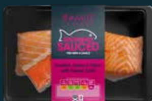
RAMUS SUSTAINABLY SAUCED Scottish Salmon Fillets with Sweet Chilli 240g