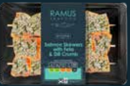
RAMUS KITCHEN Salmon Skewers with Feta & Dill Crumb 240g