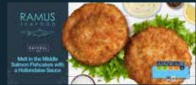
RAMUS NATURAL - FROZEN Melt in the Middle Salmon Fishcakes with a Hollandaise Sauce 180g