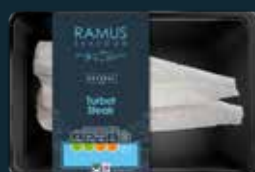
RAMUS NATURAL Turbot Steak 240g