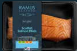
RAMUS NATURAL Scottish Salmon Fillets 240g

Our extensive Natural range is made up of the finest fish and seafood. The contemporary packaging is eye-catching, shelf ready, precision sealed (suitable for any environment), informative and offers excellent shelf life