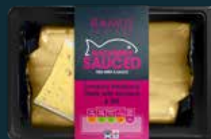
RAMUS SUSTAINABLY SAUCED Smoked Haddock Fillets with Mustard & Dill 200g