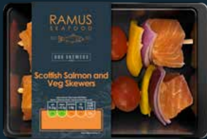
RAMUS - BBQ SKEWERS Scottish Salmon and Veg Skewers 150g

Our BBQ Skewers range is made up of the finest fish and seafood, perfectly prepared and ready for you to barbeque. The contemporary packaging is eye-catching, shelf ready, precision sealed, informative and offers excellent shelf life