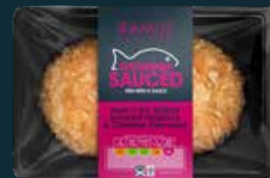
RAMUS SUSTAINABLY SAUCED Melt in the Middle Smoked Haddock & Cheddar Fishcakes 180g