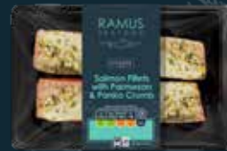
RAMUS KITCHEN Salmon Fillets with Parmesan & Panko Crumb 240g