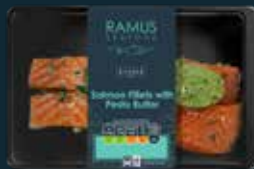
RAMUS KITCHEN Salmon Fillets with Pesto Butter 240g