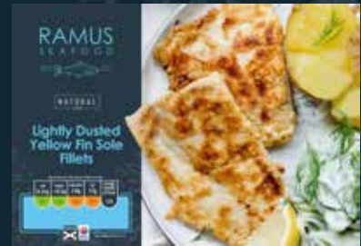
RAMUS NATURAL - FROZEN Lightly Dusted Yellow Fin Sole Fillets 320g