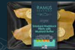
RAMUS KITCHEN Smoked Haddock Fillets with Mustard Butter 200g