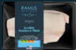
RAMUS NATURAL Scottish Haddock Fillets 240g