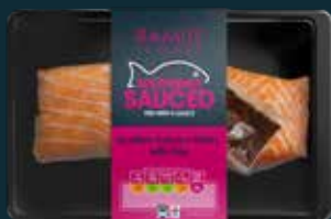
RAMUS SUSTAINABLY SAUCED Scottish Salmon Fillets with Soy 240g