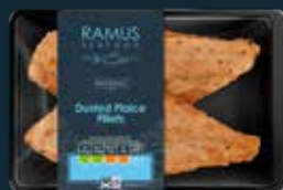
RAMUS NATURAL Dusted Plaice Fillets 250g