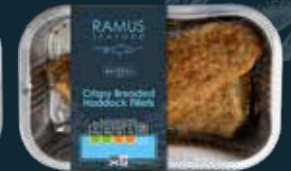
RAMUS NATURAL Crispy Breaded Haddock Fillets 250g