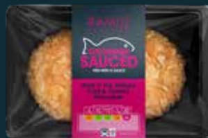
RAMUS SUSTAINABLY SAUCED Melt in the Middle Cod & Parsley Fishcakes 180g