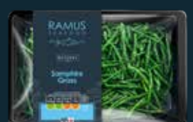
RAMUS NATURAL Samphire Grass 100g