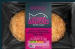
RAMUS SUSTAINABLY SAUCED Melt in the Middle Salmon & Hollandaise Fishcakes 180g