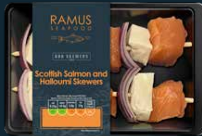
RAMUS - BBQ SKEWERS Scottish Salmon and Halloumi Skewers 150g