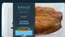
RAMUS NATURAL Smoked Mackerel 180g