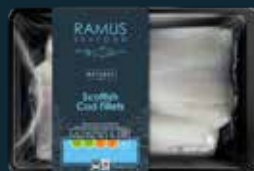
RAMUS NATURAL Scottish Cod Fillets 240g