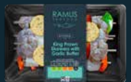
RAMUS KITCHEN King Prawn Skewers with Garlic Butter 240g