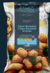
RAMUS NATURAL - FROZEN Giant Wholetail Crispy Breaded Scampi 200g