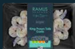
RAMUS KITCHEN King Prawn Tails Garlic 180g