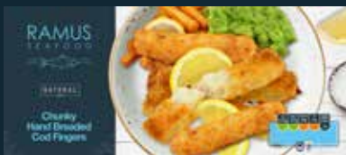
RAMUS NATURAL - FROZEN Chunky Hand Breaded Cod Fingers 250g