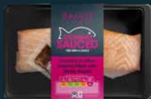
RAMUS SUSTAINABLY SAUCED Roasted Scottish Salmon Fillets with Sticky Maple 200g