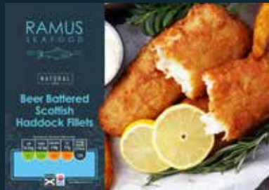
RAMUS NATURAL - FROZEN Beer Battered Scottish Haddock Fillets 440g