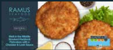
RAMUS NATURAL - FROZEN Melt in the Middle Smoked Haddock Fishcakes with a Cheddar & Leek Sauce 180g