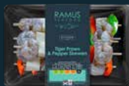
RAMUS KITCHEN Tiger Prawn & Pepper Skewers 180g