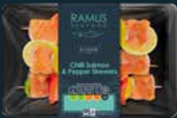
RAMUS KITCHEN Chilli Salmon & Pepper Skewers 240g