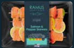
RAMUS KITCHEN Salmon & Pepper Skewers 240g