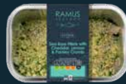
RAMUS KITCHEN Sea Bass Fillets with Cheddar, Lemon & Parsley Crumb 180g