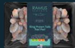
RAMUS KITCHEN King Prawn Tails Peri Peri 180g