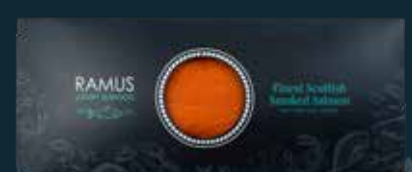
RAMUS NATURAL Finest Scottish Smoked Salmon 1000g