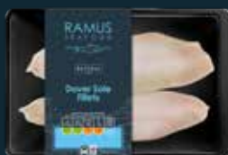
RAMUS NATURAL Dover Sole Fillets 200g