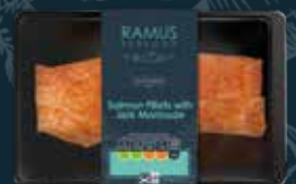
RAMUS KITCHEN Salmon Fillets with Jerk Marinade 240g