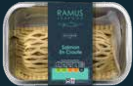
RAMUS KITCHEN Salmon En Croute 300g

The Ramus Kitchen range combines the finest fish and seafood with our chef's delicious complementary ingredients. These signature dishes are beautifully presented and offer excellent shelf life