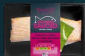
RAMUS SUSTAINABLY SAUCED Poached Scottish Salmon Fillets with Lime & Coriander 200g