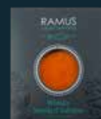
RAMUS NATURAL Whisky Smoked Salmon 100g