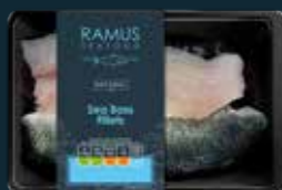
RAMUS NATURAL Sea Bass Fillets 180g