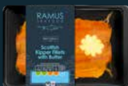
RAMUS NATURAL Scottish Kipper Fillets with Butter 200g