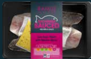
RAMUS SUSTAINABLY SAUCED Sea Bass Fillets with Beurre Blanc 180g