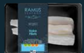
RAMUS NATURAL Hake Fillets 240g