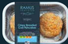
RAMUS NATURAL Crispy Breaded Cod Fishcakes 180g