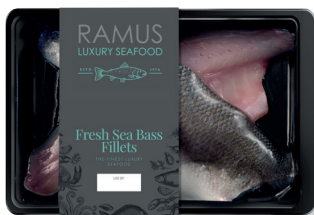
RAMUS FRESH Sea Bass Fillets 180g