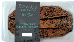
RAMUS FRESH Smoked Peppered Mackerel 180g