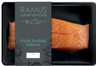
RAMUS FRESH Scottish Salmon 240g