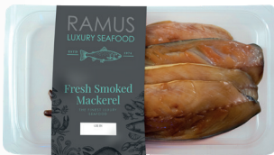
RAMUS FRESH Smoked Mackerel 180g