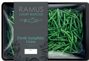
RAMUS FRESH Samphire Grass 100g