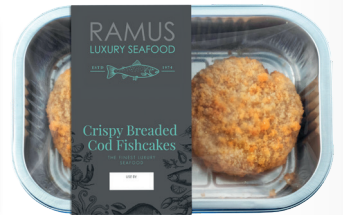
RAMUS FRESH Crispy Breaded Cod Fishcakes 180g