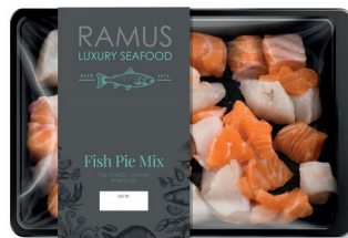
RAMUS FRESH Fish Pie Mix 350g