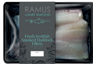
RAMUS FRESH Scottish Smoked Haddock Fillets 200g