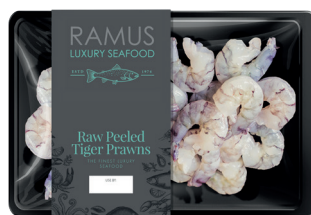
RAMUS FRESH Raw Peeled Tiger Prawns 200g