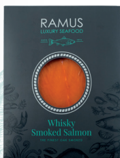
RAMUS FRESH Whisky Smoked Salmon 100g