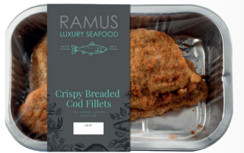
RAMUS FRESH Crispy Breaded Cod Fillets 240g