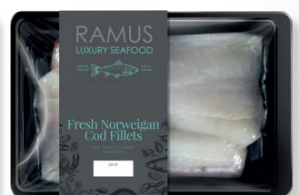
RAMUS FRESH Norwegian Cod Fillets 200g