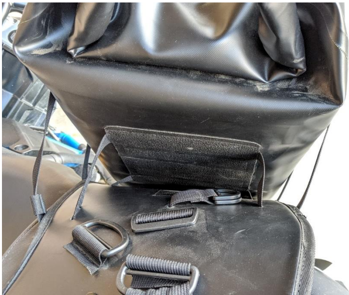
FIG7 Top Looking down

1. Begin with the Top Front Slot on the B-Base. Thread the 1" Webbing of the top front strap from the Rolie Bag through the corresponding slot and around the Rolie Bag, thread the keeper to the webbing, continue to the 1" Buckle on the front/outside of the Rolie Bag. FIG7&8