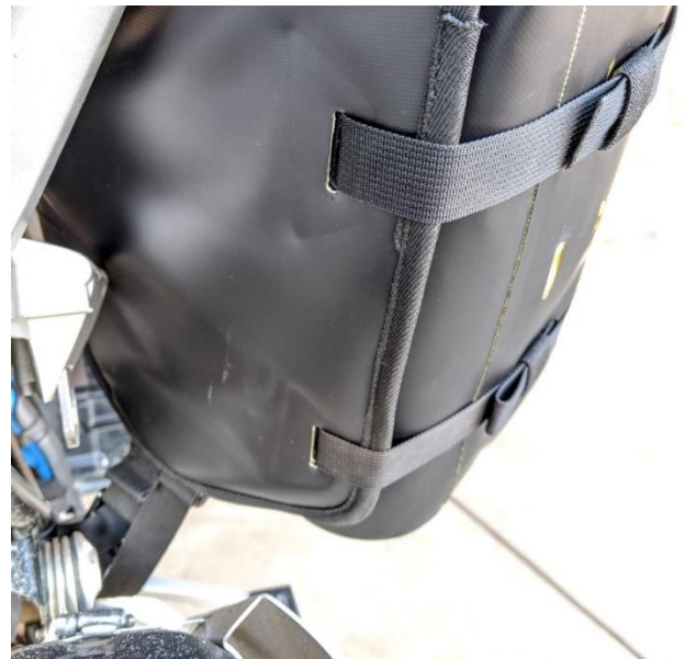
FIG8 (Right Underside Rear Shown)