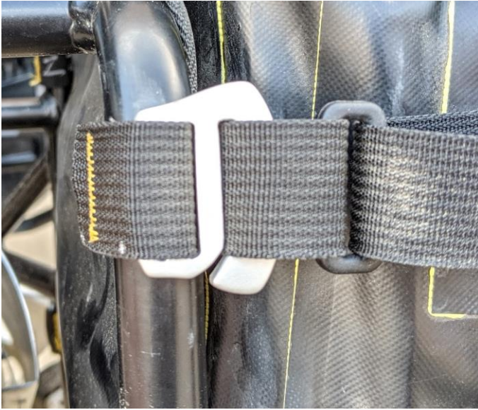
FIG10 Side View