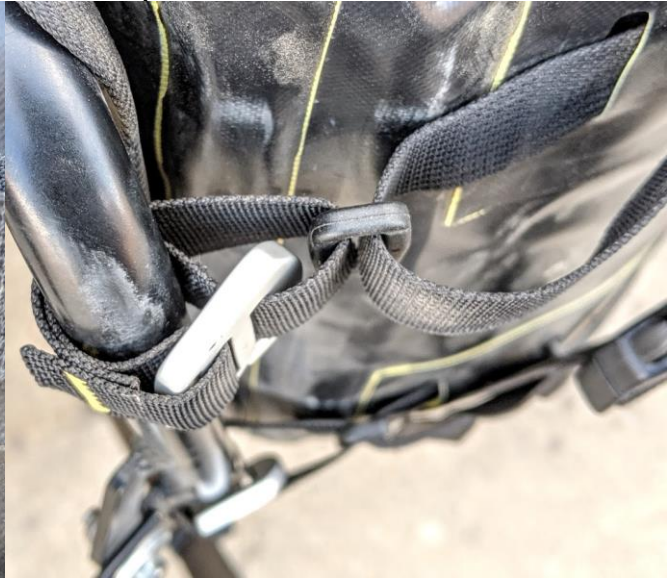
FIG11 Top View