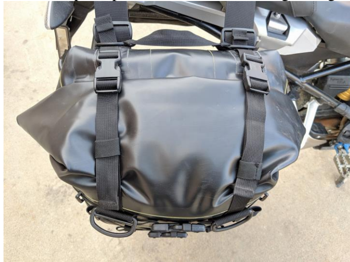
FIG16 Top Straps. Thread excess webbing through elastic loops.

14- For maximum safety make sure ALL straps are snug and secure. Make adjustments as necessary.