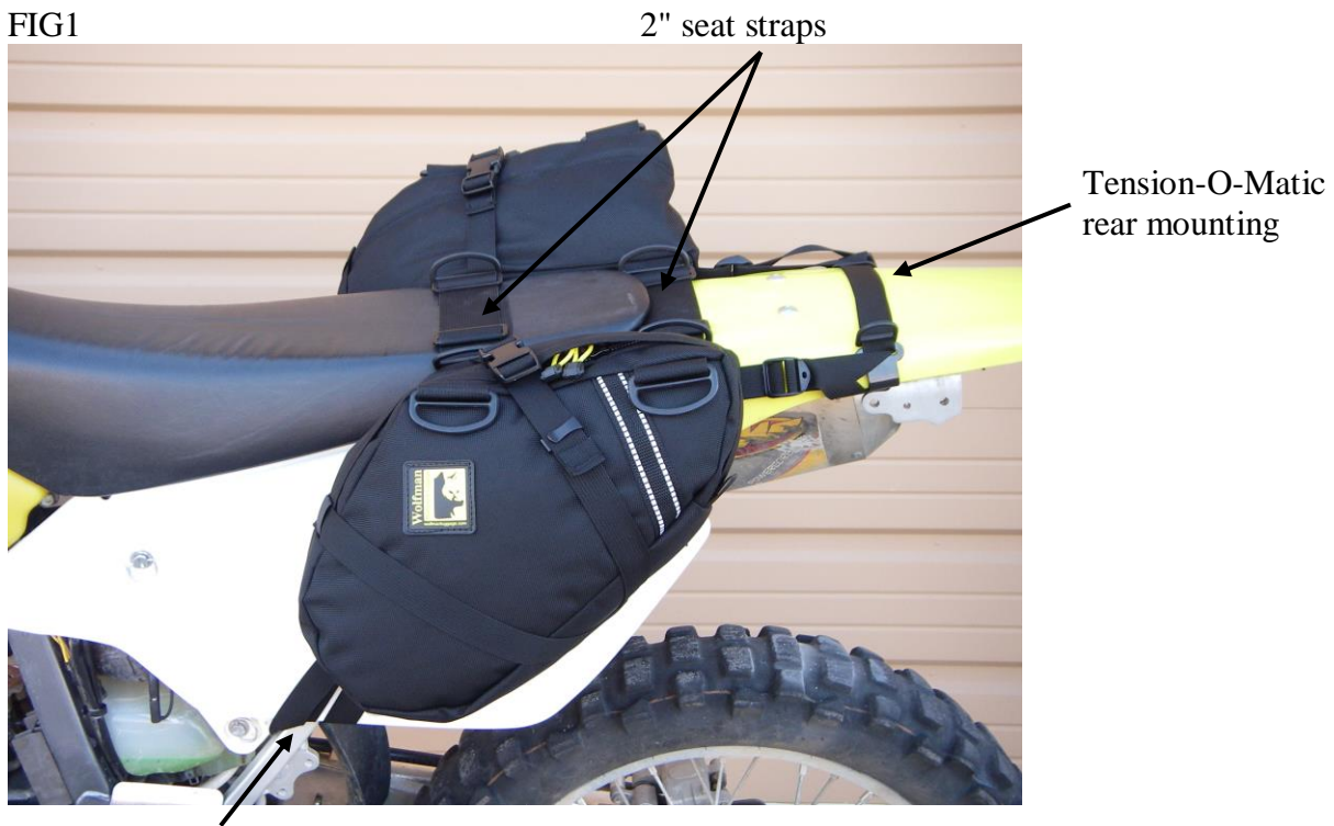
Front mounting straps