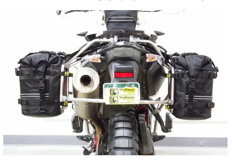
FIG.5 (This is a rear view of a properly adjusted set of saddle bags)

2- Place bags over the seat and/or rear rack. Depending on the width of your motorcycle, you may need to adjust the height of each bag. Do this by adjusting the 2" seat strap webbing from the large center buckles. Adjust so that the bags are centered on each side rack. FIG.5