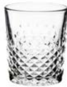
DOUBLE WALLED COFFEE GLASS $1.75 ea