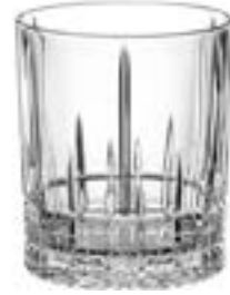
12OZ OLD FASHIONED GLASS $2.00 ea