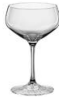
COCKTAIL COUPE $2.25 ea