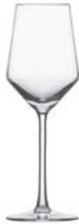
ALL PURPOSE WINE GLASS $2.25 ea