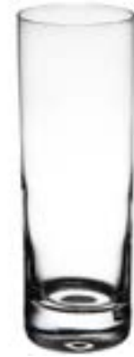
COLLINS GLASS $.90 ea