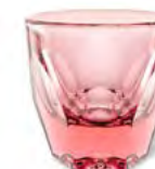
8oz CAPPUCCINO GLASS ROSE | $2.25 ea