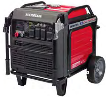
Honda EU7000 Model | Rental Price $200 [ To be used when power specs can not be supplied ]