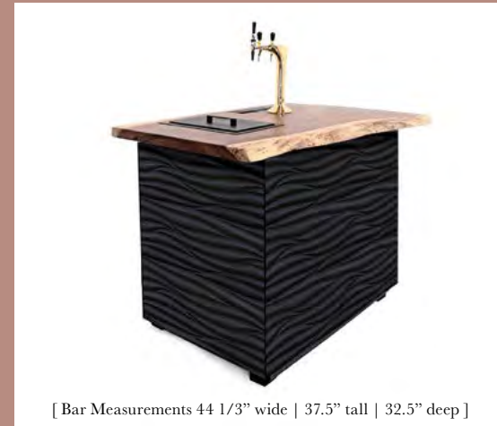
[ Bar Measurements 44 1/3" wide | 37.5" tall | 32.5" deep ]