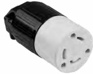
30A Industrial Grade Non-Shrouded Locking [ NEMA L6-30c ]