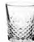
DOUBLE WALLED COFFEE GLASS $1.75 ea