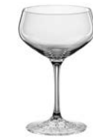
COCKTAIL COUPE $2.25 ea