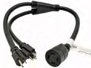
Splitter Cable [ 2 x Dedicated 20 Amp Circuits needed ]

To be used together when NEMA L6-30R Cannot be Supplied