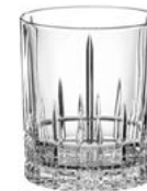
12oz OLD FASHIONED GLASS $2.25 ea