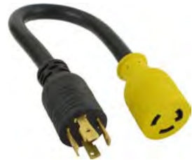
Espresso Machine Plug [ NEMA L6 30 amp 240v ]

To be used together when NEMA L6-30R Cannot be Supplied