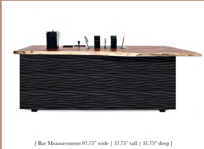
[ Bar Measurements 97.75" wide | 37.75" tall | 31.75" deep ]