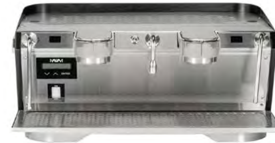
[ Custom color panel + Artwork ]