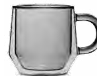
8oz COFFEE MUG $2.25 ea