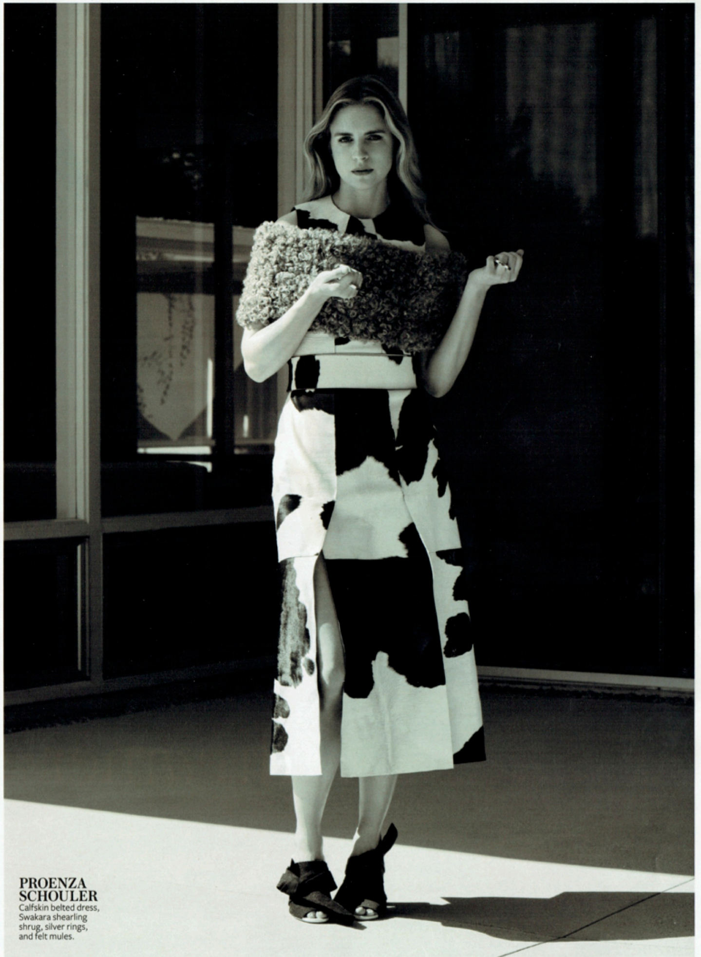
PROENZA SCHOUER Calfskin belted dress, Swakara shearling shrug, silver rings, and felt mules.