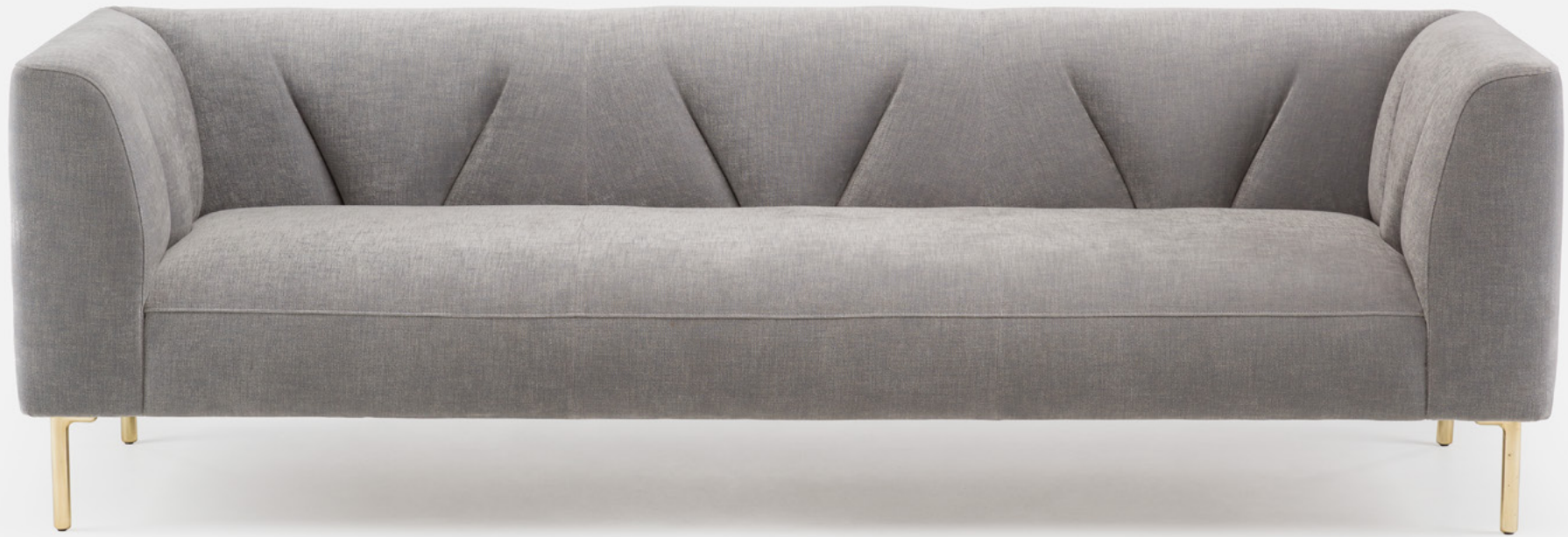
054 GATES SOFA

Jason Miller's furniture is inspired by the housing trend currently prevalent in Brooklyn, where 100-year-old brownstones, originally built as single family homes then converted into apartment buildings, are being converted back into single family homes. Many of these buildings still retain original details such as ornate fireplaces, moldings and woodwork, but are in need of renovations, creating an interesting juxtaposition of old and new design. Jason Miller's product line captures this juxtaposition of time, purpose, and aesthetics.