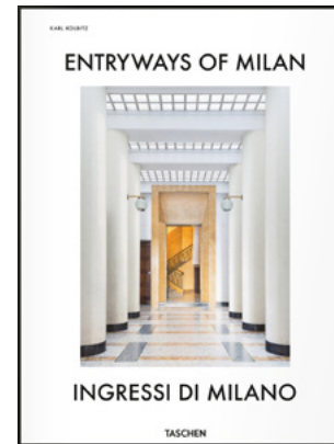
Entryways of Milan Ingressi Di Milano Taschen

Jason Miller is inspired by common aspects of American culture, as well as the forms of nature, whether the striking shapes of fluid in motion, or the photorealistic paintings by Vija Celmins of oceans, spiders' webs and stars. Modern Italian design, rich with expressive curves and unmistakable luxury also informs his work, as he takes inspiration not only from the materials and contours, but their relationship with space. Miller is interested in the way interior environments define experiences and express personal styles, approaching furniture design with a view to the wider context of domesticity.