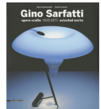
Gino Sarfatti Opere Scelte 1938 - 1973 Selected Works Silvana Editoriale