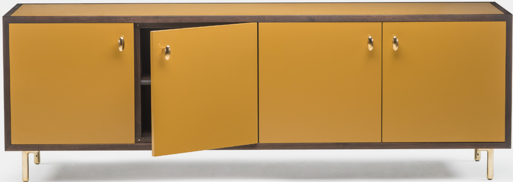
052 CLASSON SIDEBBOARD