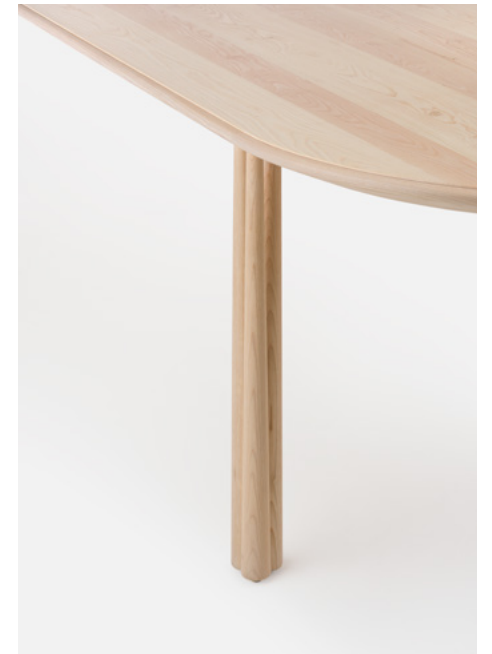
051 ELLIOT DINING TABLE