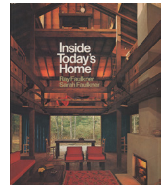
Inside Today's Home Holt, Rinehart and Winston