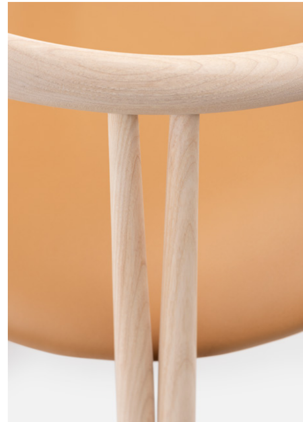
050 ELLIOT DINING CHAIR