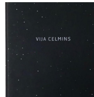
Vija Celmins Works 1964 - 96 Distributed by DAP