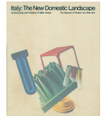
Italy: The New Domestic Landscape The Museum of Modern Art, NYC