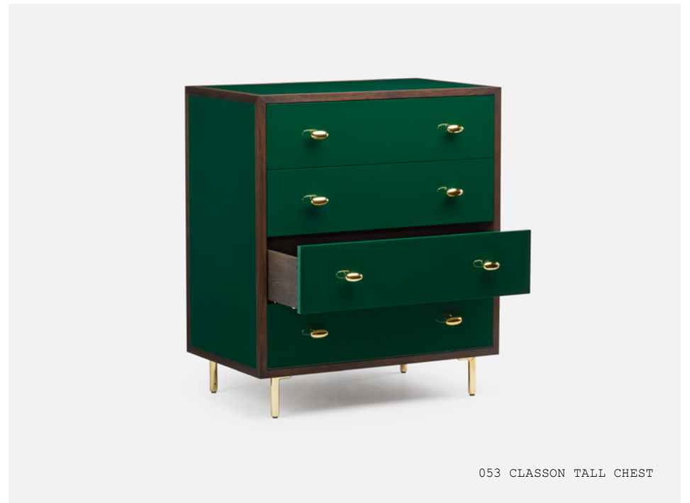
053 CLASSON TALL CHEST