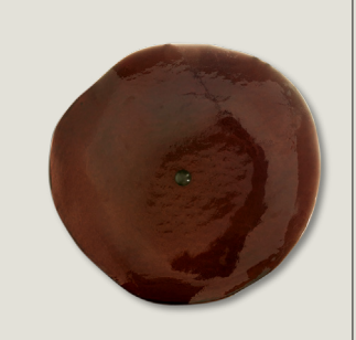
Each piece is unique and handmade. Glaze variations may occur.

Overall Dimensions: 32"dia x 24"h Ceramic Shades: White Canopy / Stems: Blackened Brass