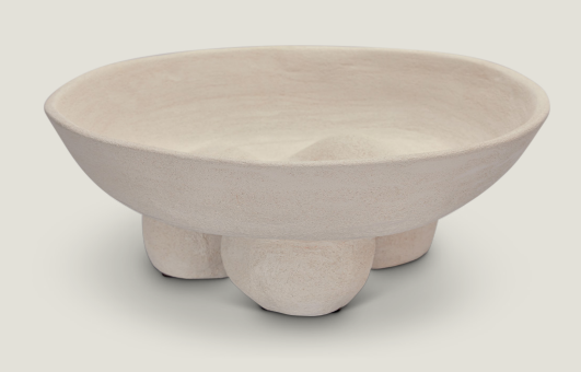
Glaze variations may occur. Dimensions: 18.5"w x 21"d x 20.5"h Top: Clear Oak Base: Stoneware Finish: Ochre

Glaze variations may occur. Dimensions: 16.5"dia x 6.75"h Material: Stoneware Finish: White