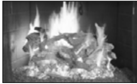
"TEXAS HICKORY FIRE"