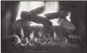
"ROUND MOUNTAIN" MASSIVE OAK