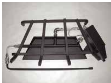
ABOVE SHOWN WITH OPTIONAL CEBB-CONTROLLED EMBER BED BURNER INSTALLED.