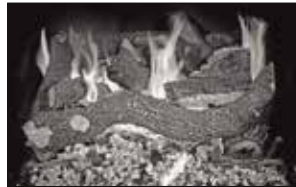
"CHARRED HOLLOW OAK"