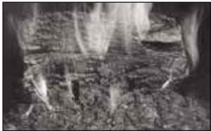
"PAUL BUNYAN" MASSIVE OAK "Signature" SERIES