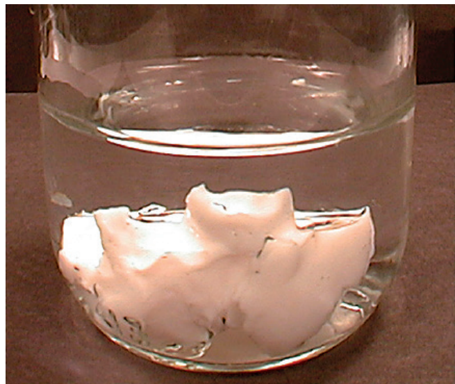
Krytox™ grease in hydrocarbon solvent is not dissolved.