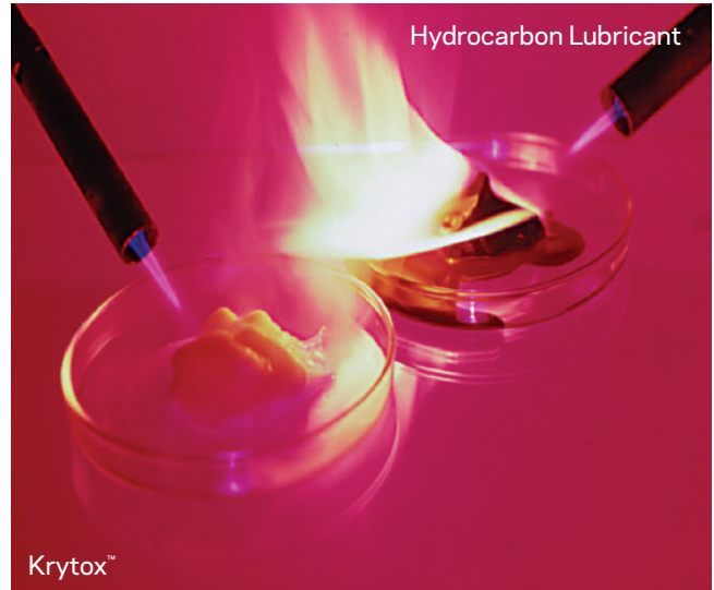
Hydrocarbon-based lubricants burn; Krytox™ does not.

During depolymerization, gaseous decomposition products are given off, and the remaining fluid is less viscous; but, no sludge or gummy deposits are formed.