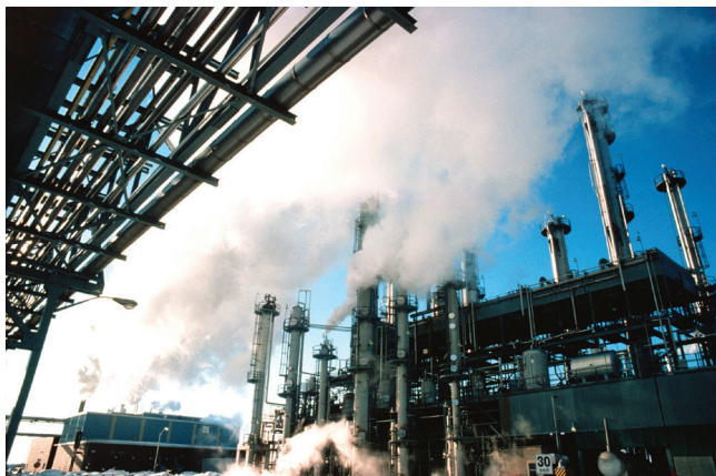
Krytox™ XHT greases can be used in many industrial applications in extreme thermal conditions.