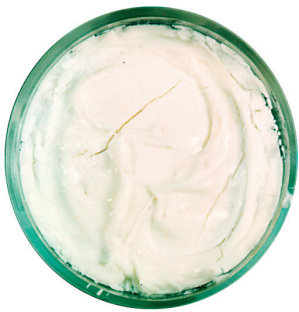
In oven at 232 °C (448 °F) for 40 hr: Krytox™—0% wt loss