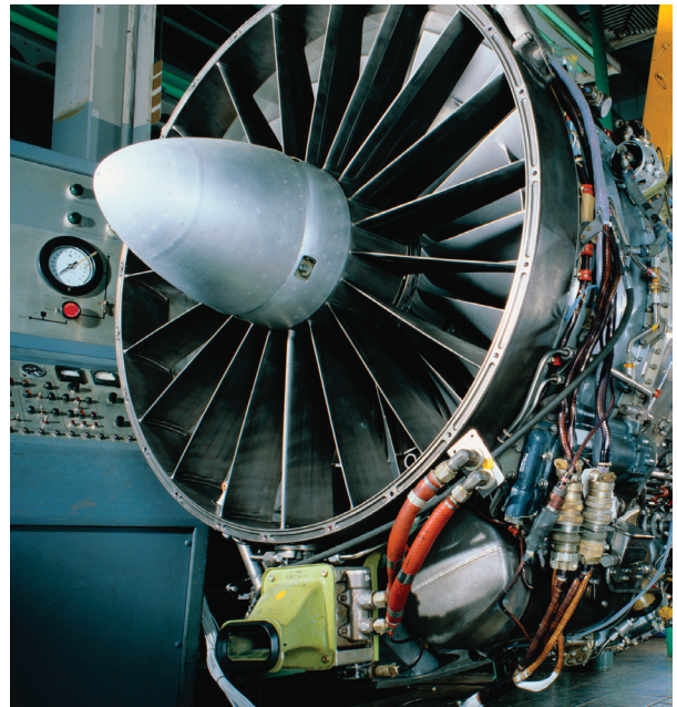
Krytox™ XHT Grades: Extreme Conditions, Extreme Performance

Krytox™ XHT greases are available with useful temperature ranges up to 360 °C (680 °F) for continuous use, with spikes to 400 °C (752 °F), when used in proper metallurgy with periodic re-lubrication.