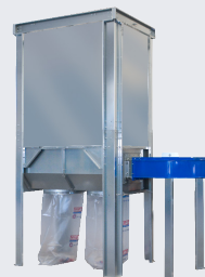
Optional panels for enclosed version - Outdoor unit