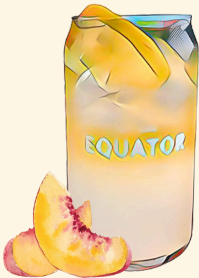
Peach Blossom Lemonade $6.50