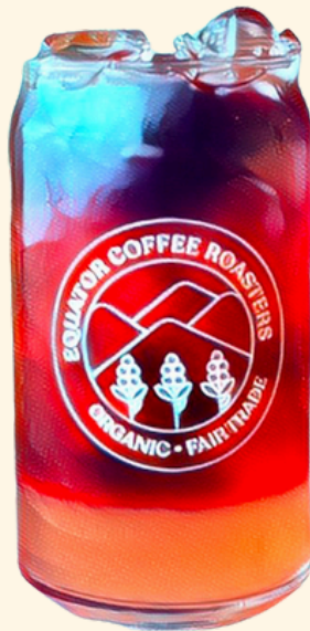
Summer Sunset $6.25