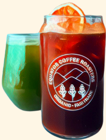
Espresso Tonic or Matcha Tonic $6.80