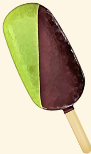
Matcha Dip Bar (GF & V) $6.00