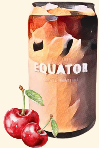
Cherry Cola Chai $6.90