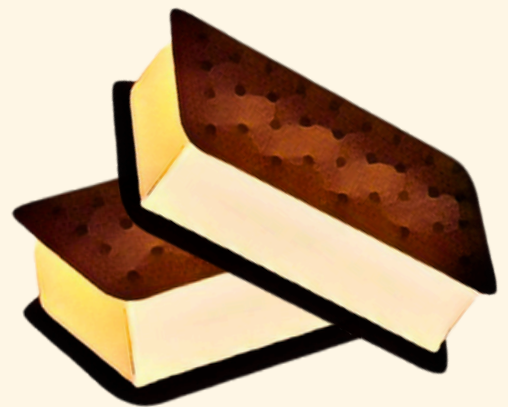
Cappuccino Ice Cream Sando (GF & V) $6.90