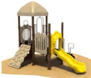
PIRATE SHIP – YELLOW