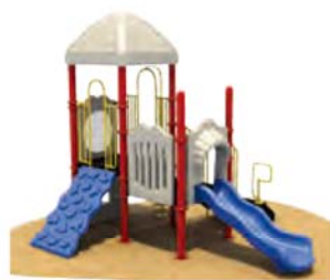
CASTLE – BLUE