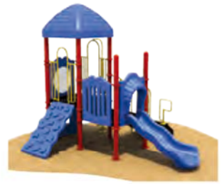
BLUE MOON- PRIMARY