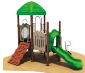
BACKWOODS - NATURAL