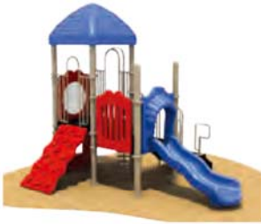
PLATINUM – PRIMARY