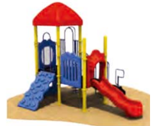
RED RIVER – PRIMARY