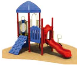
FIRECRACKER – PRIMARY