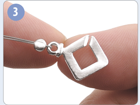
3 Once securely closed, Crimp Covers provide an ultra-smooth, clean finish.