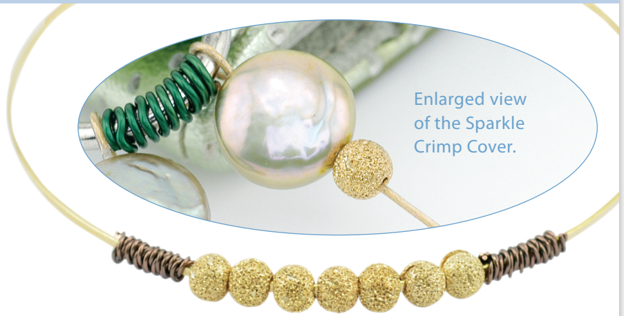
Enlarged view of the Sparkle Crimp Cover.