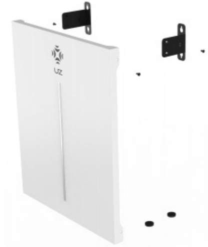
C100 (1 set)