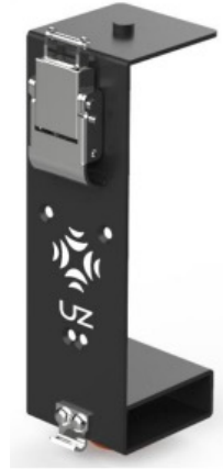
H100 (1 pcs)