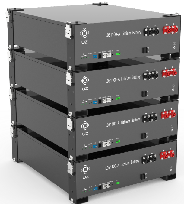
Bundle Installation Demo