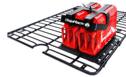
Fuel Can Holder