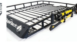
Axe and Shovel for 5" height Racks