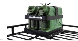
Water Can Holder