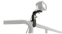
Light Clamp mount