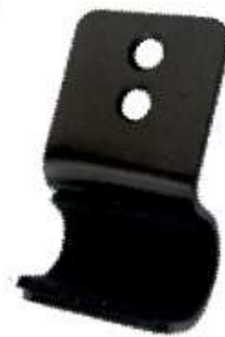
Clamp with two holes (x2)