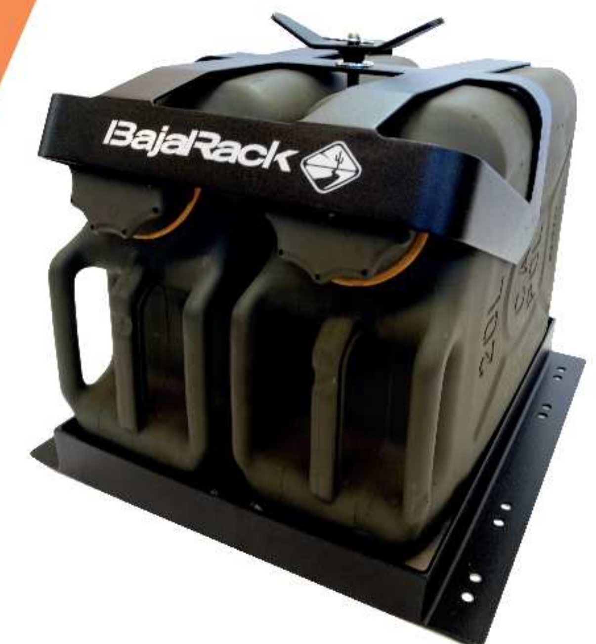
Fuel can holder LR