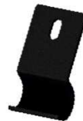
Clamp with one slot (x2)

Important: For the clamps installation is indistinct the order for the clamps. Two clamps has two holes and the other clamps has one slot. See the below image as reference.