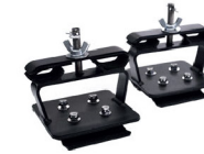
Axe & Shovel mount for flat racks