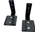
Awning mount for flat racks (2 pieces)