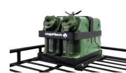
Water Can Holder