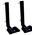
Maxtrax mount for flat racks