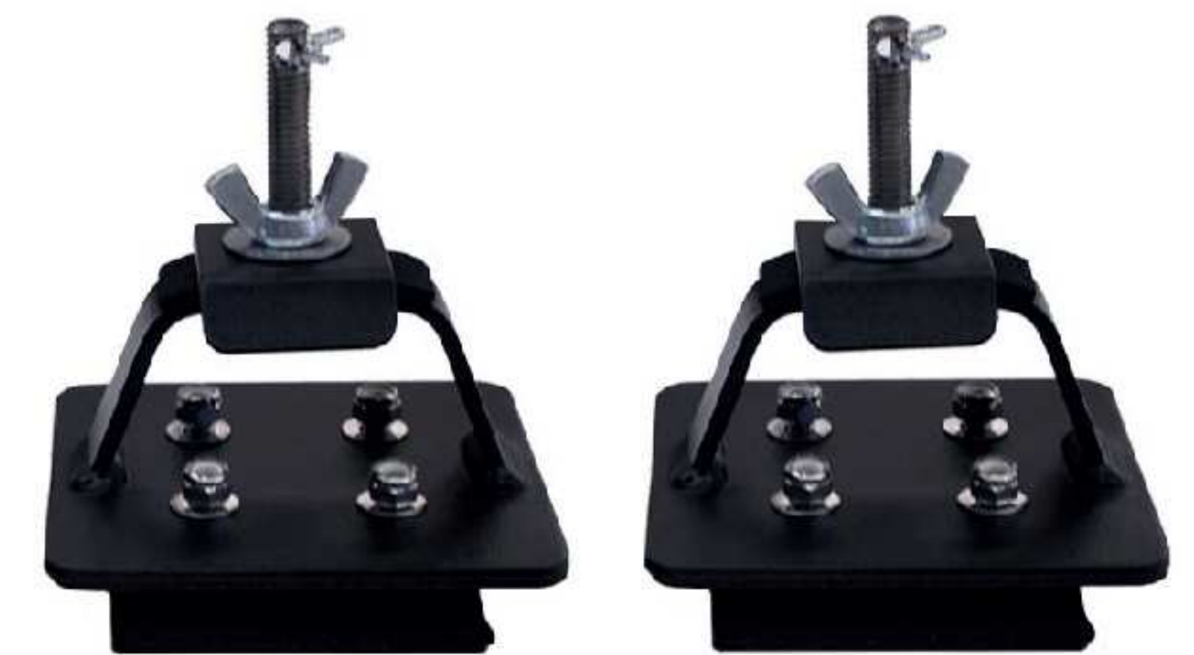
Hi-Lift mount for Flat Racks